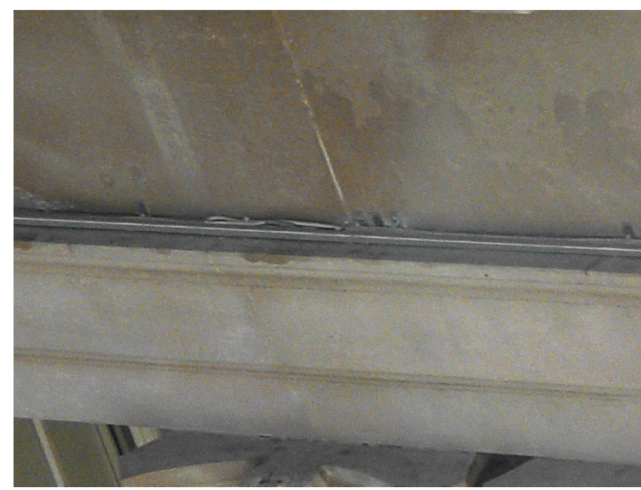
LEAD TAB FIXINGS FOR LED LIGHT AND CABLE