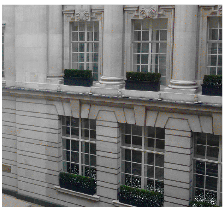
EXISTING LEAD TAB CABLE FIXINGS AND LIGHTING FITTING MOUNTING PLATE RE-USED