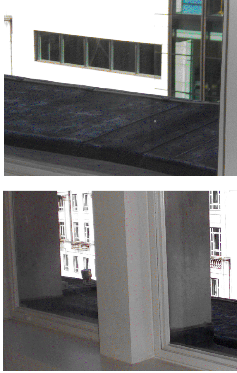
LEAD TAB CABLE FIXINGS RE-USED