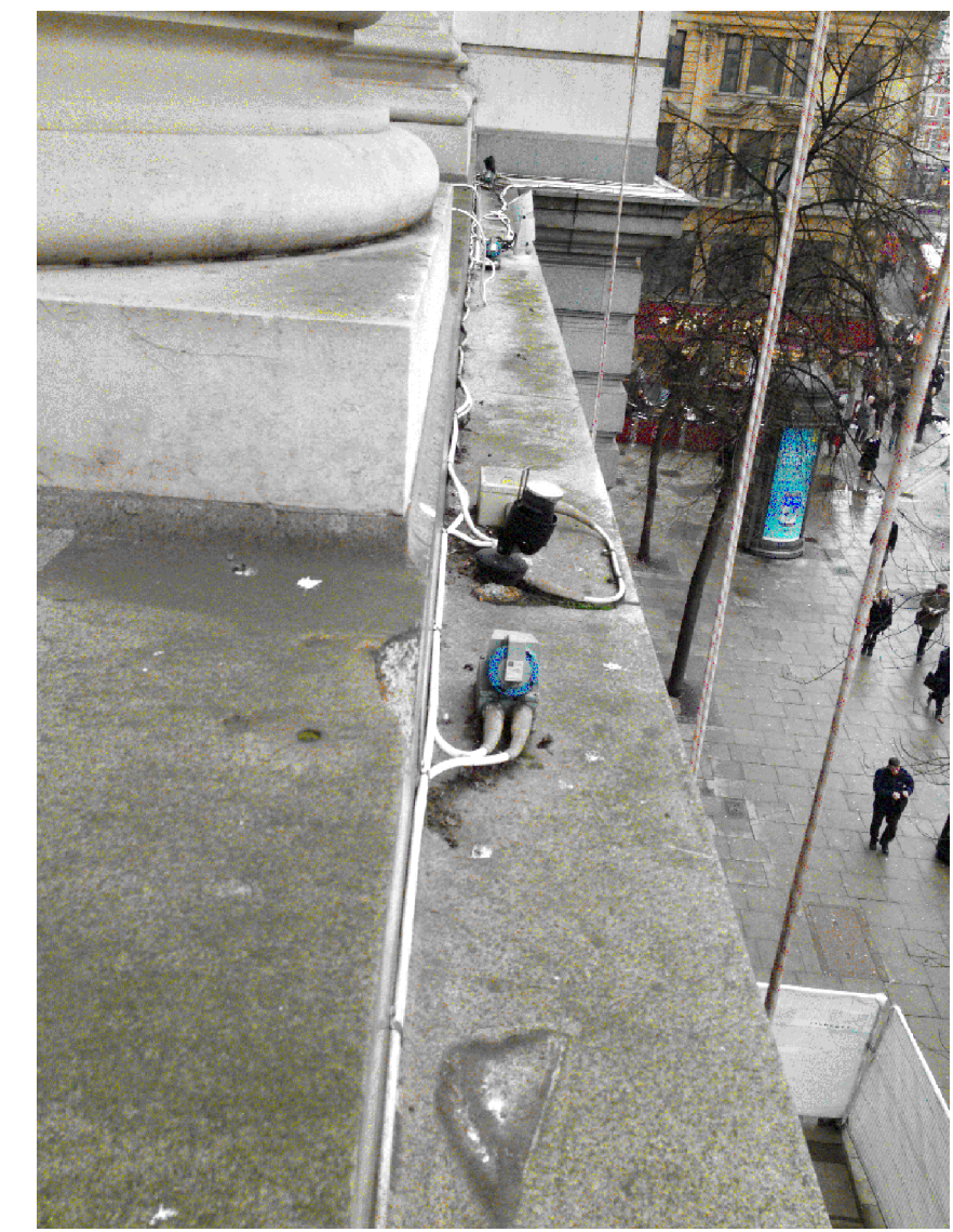
EXISTING CABLE FIXINGS RE-USED