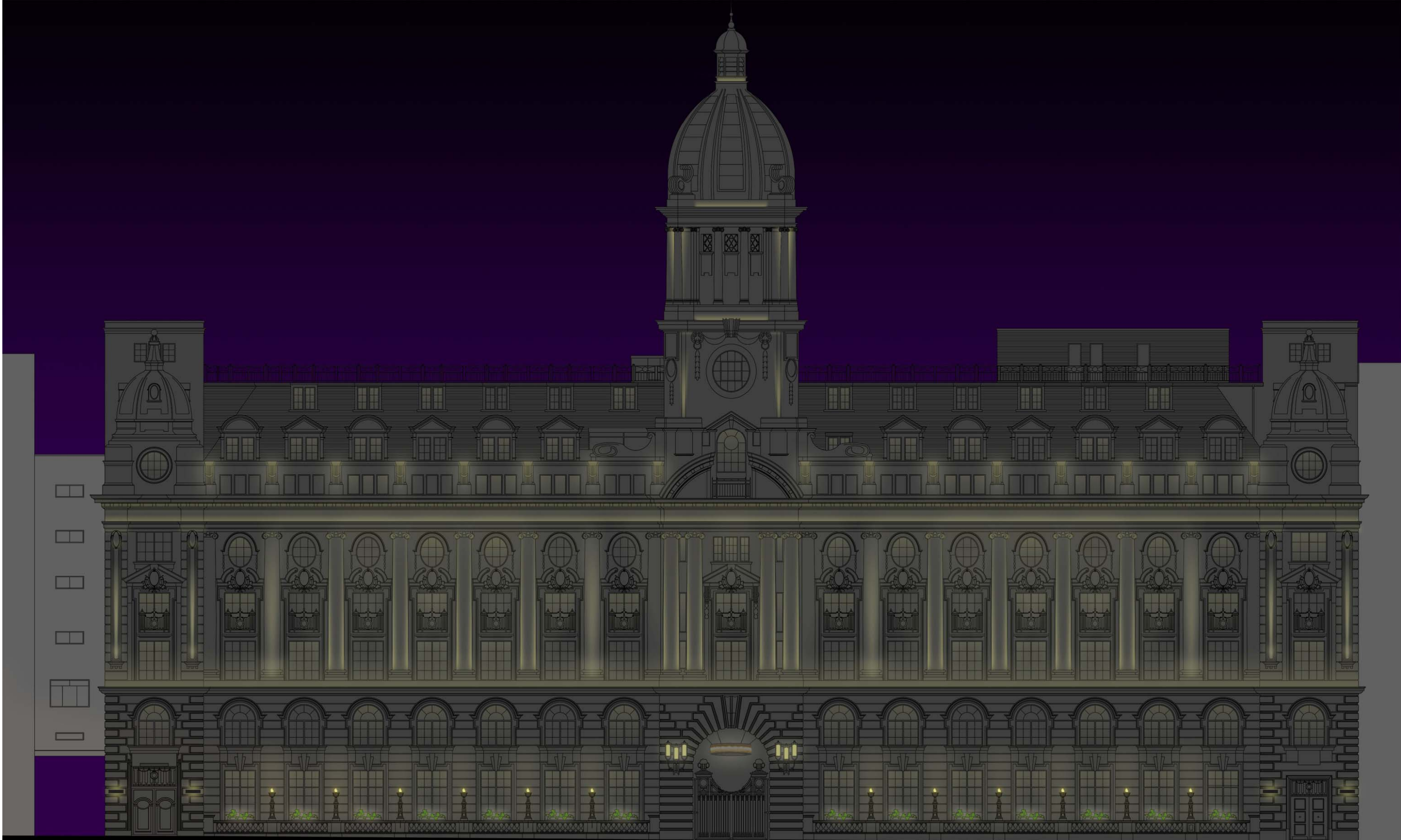
DIAGRAMMATICAL FRONT FACADE RENDER