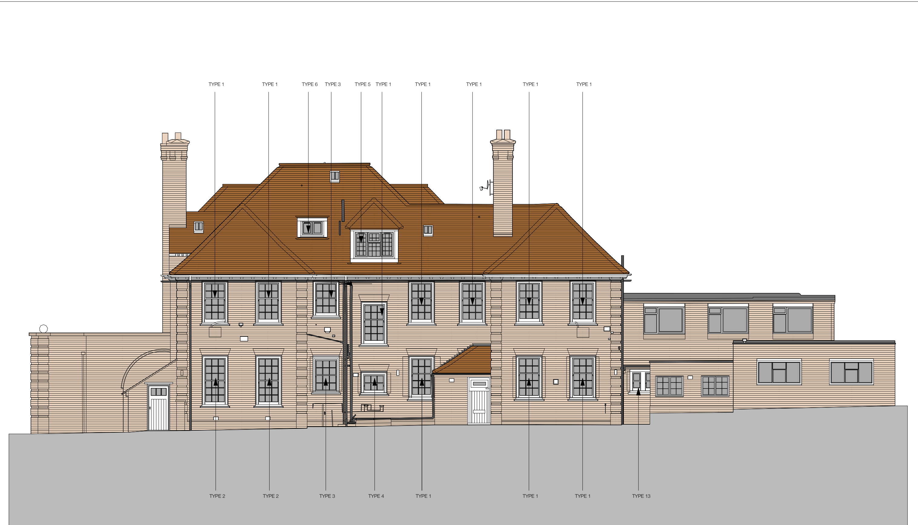
A Proposed Rear Elevation General arrangement PL.07 1/50@A1_1/100@A3