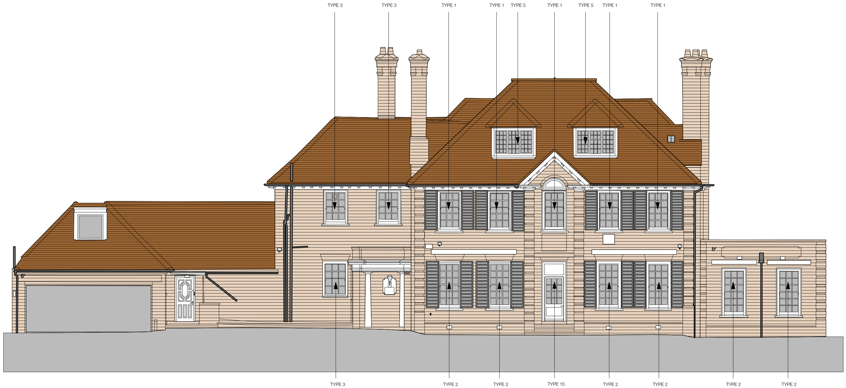
A Proposed Front Elevation General arrangement PL.06 1/50@A1_1/100@A3