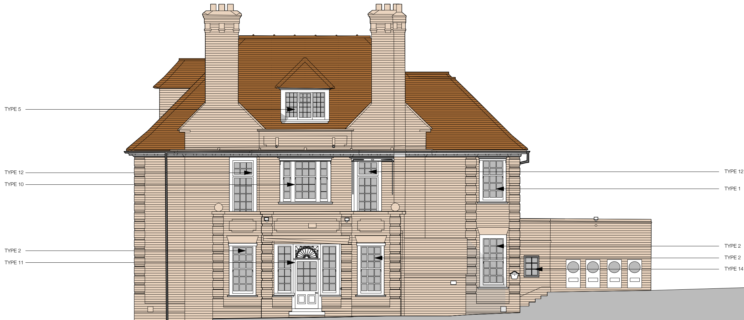
A Proposed East Elevation General arrangement PL.05 1/50@A1_1/100@A3