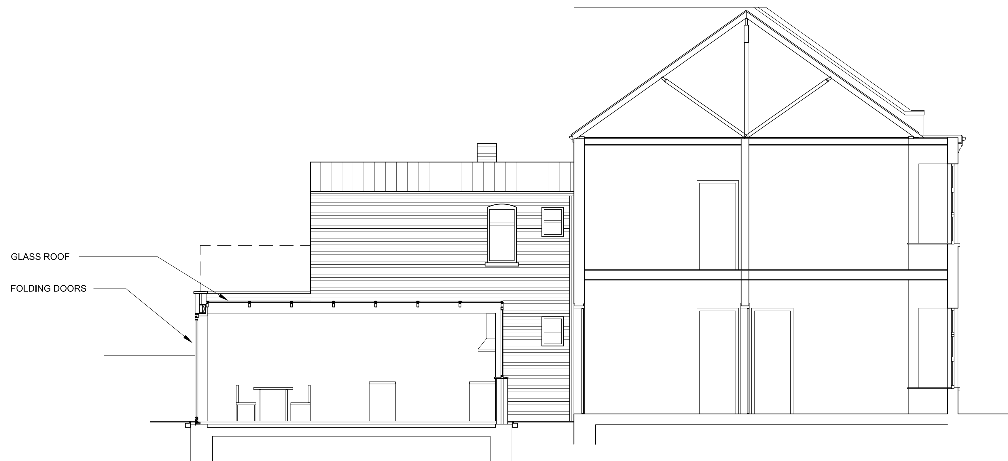
SECTION B - B