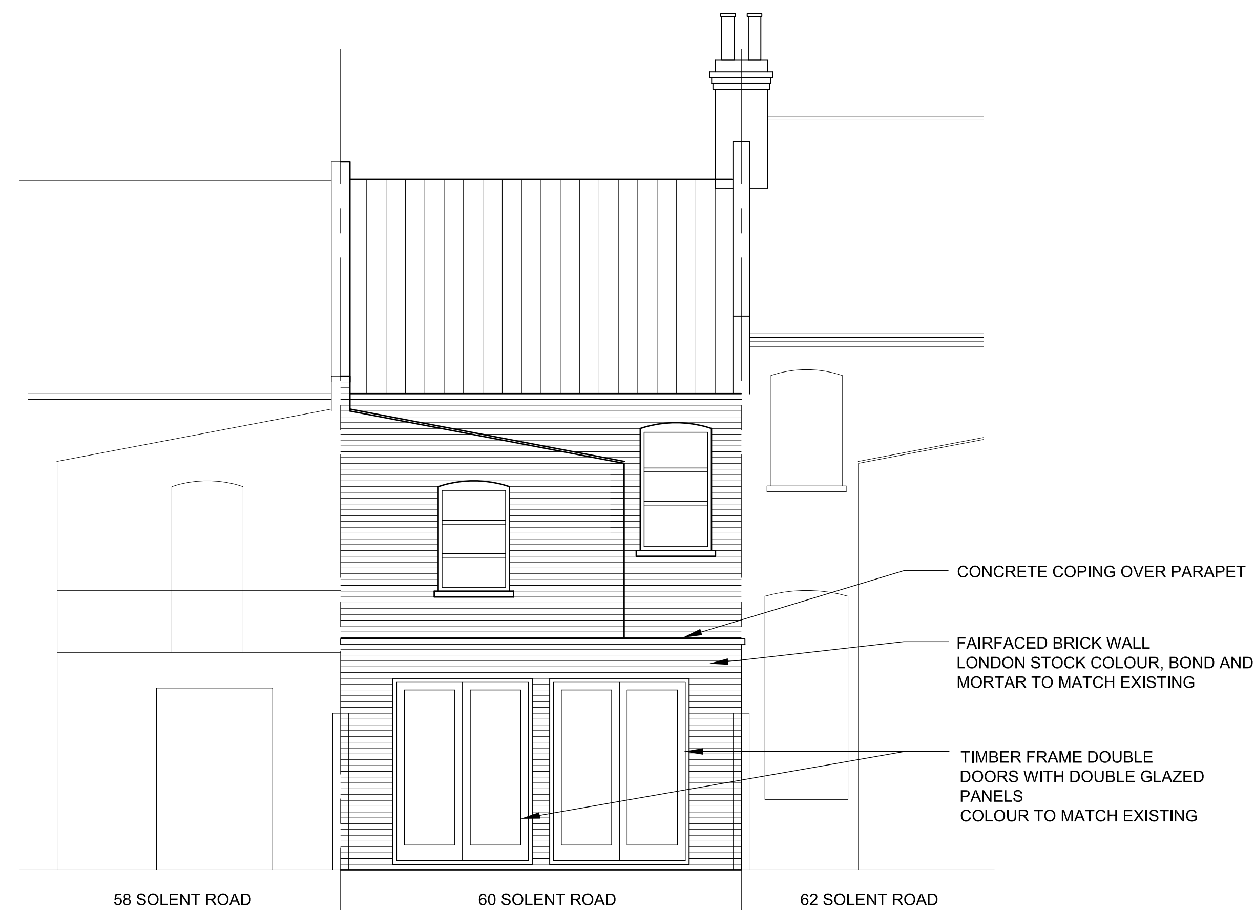
NORTH EAST ELEVATION (REAR ELEVATION)

notes Drawing indicates design intent only Any subsequent approvals do not release the trade obligations under the trade contract The trade contractor is responsible for taking and checking site dimensions Report all conflicts of information to the Architect If in doubt ask