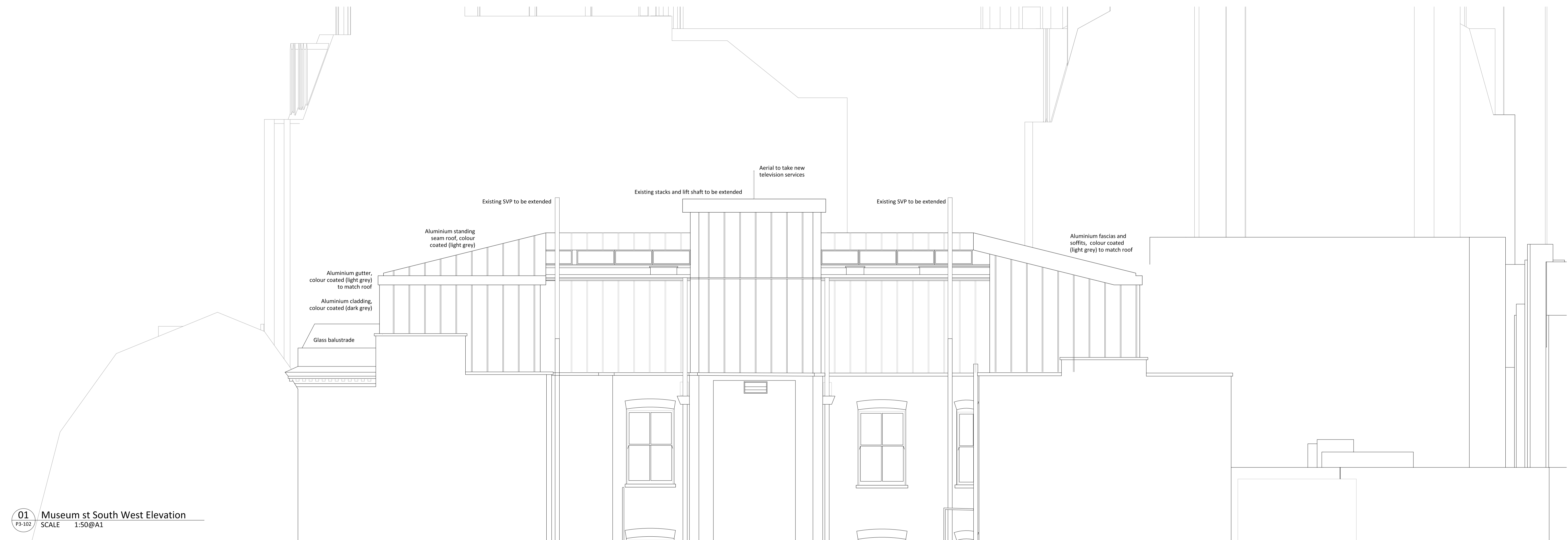
01 Museum st South West Elevation SCALE 1:50@A1

Aluminium gutter, colour coated (light grey) to match roof Aluminium cladding, colour coated (dark grey) Glass balustrade Aluminium standing seam roof, colour coated (light grey) Existing SVP to be extended Existing stacks and lift shaft to be extended Aerial to take new television services Existing SVP to be extended Aluminium fascias and soffits, colour coated (light grey) to match roof