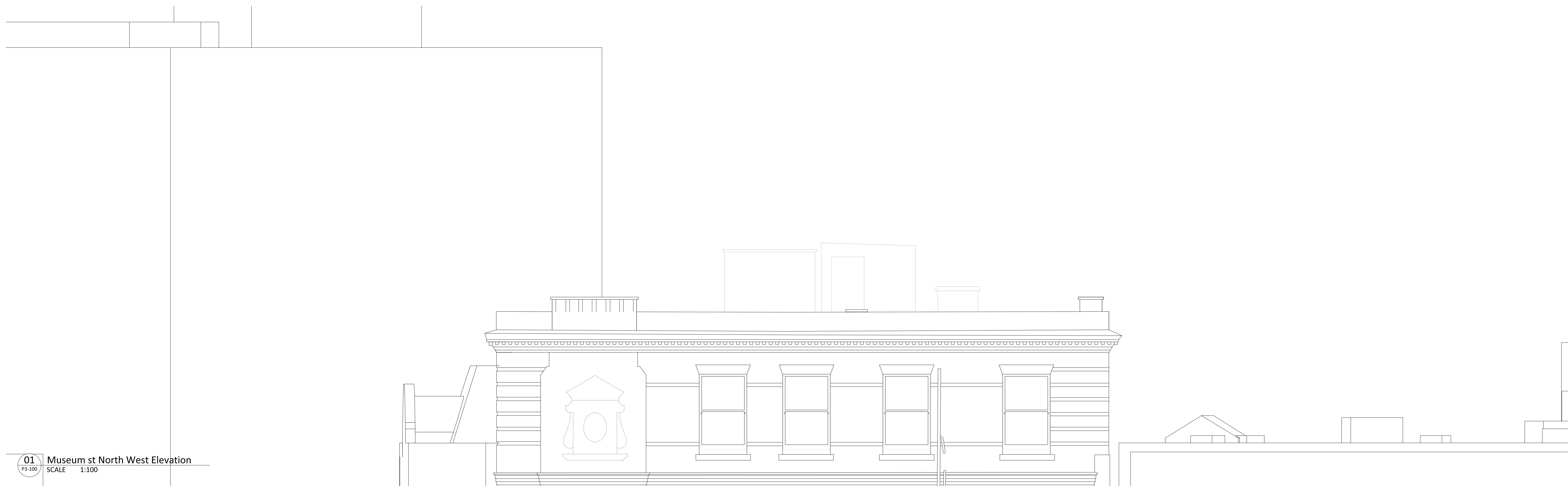
01 Museum st North West Elevation SCALE 1:100

NOTES CONSULTANTS - Refer to highways consultant's drawings for details - Refer to landscape consultant's drawings for details - Landscaping layout is indicative only AREAS - Refer to area schedule PLANNING © Copyright Reserved. ColladoCollins Partners LLP