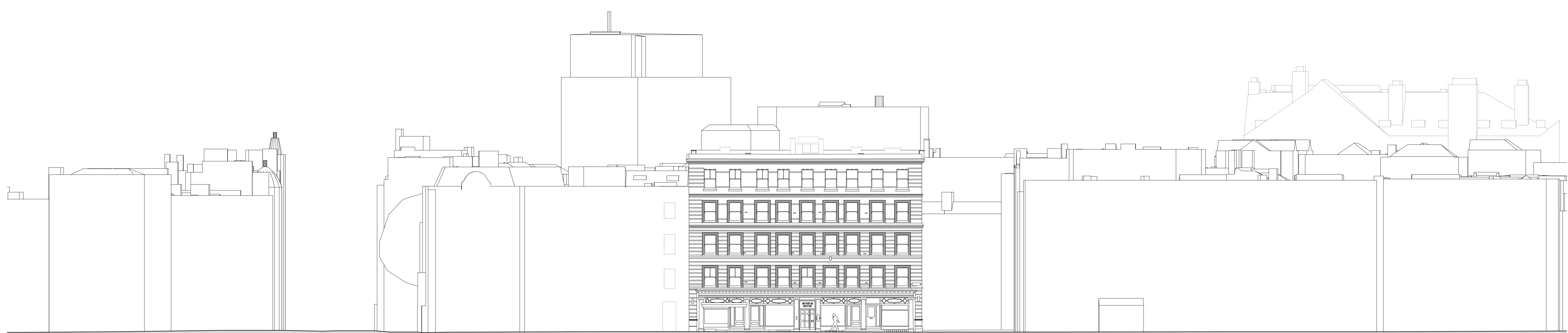
01 Museum st North East Elevation P3-101 SCALE 1:200