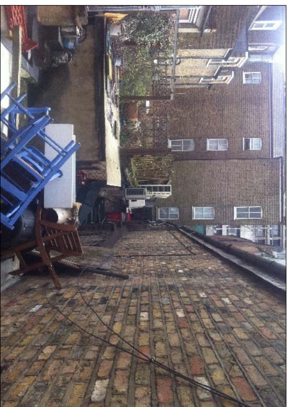
View south from flat roof