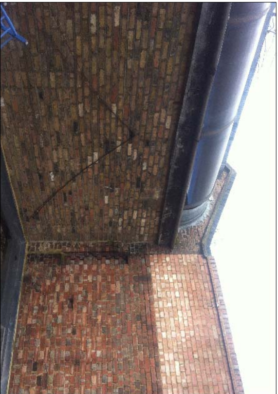
Boundary walls to flat roof