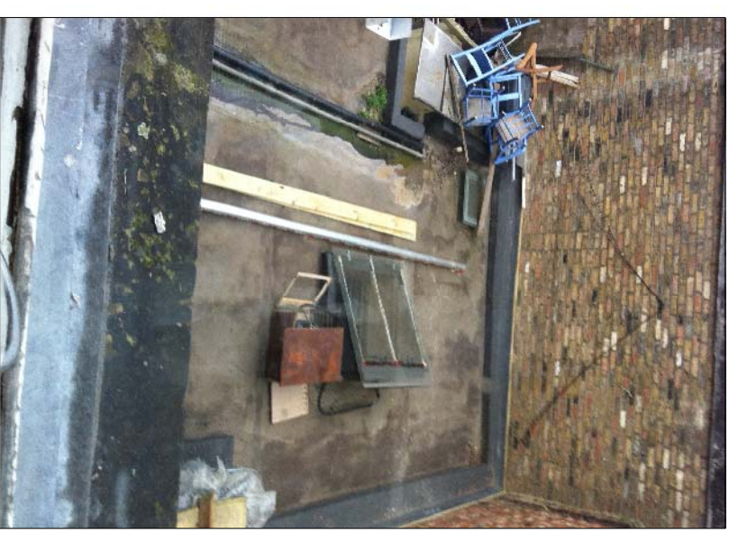
Flat roof of application site from above