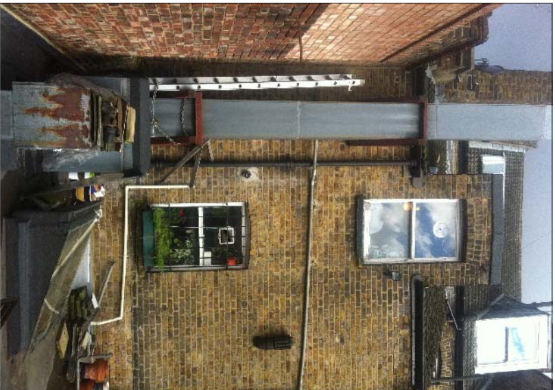
Rear elevation of application site showing chimney