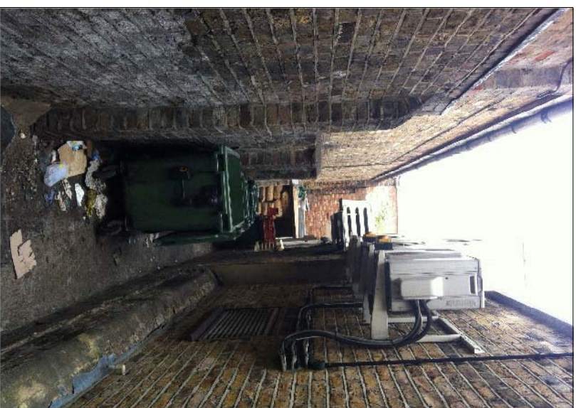
Common access to rear of properties along South End road