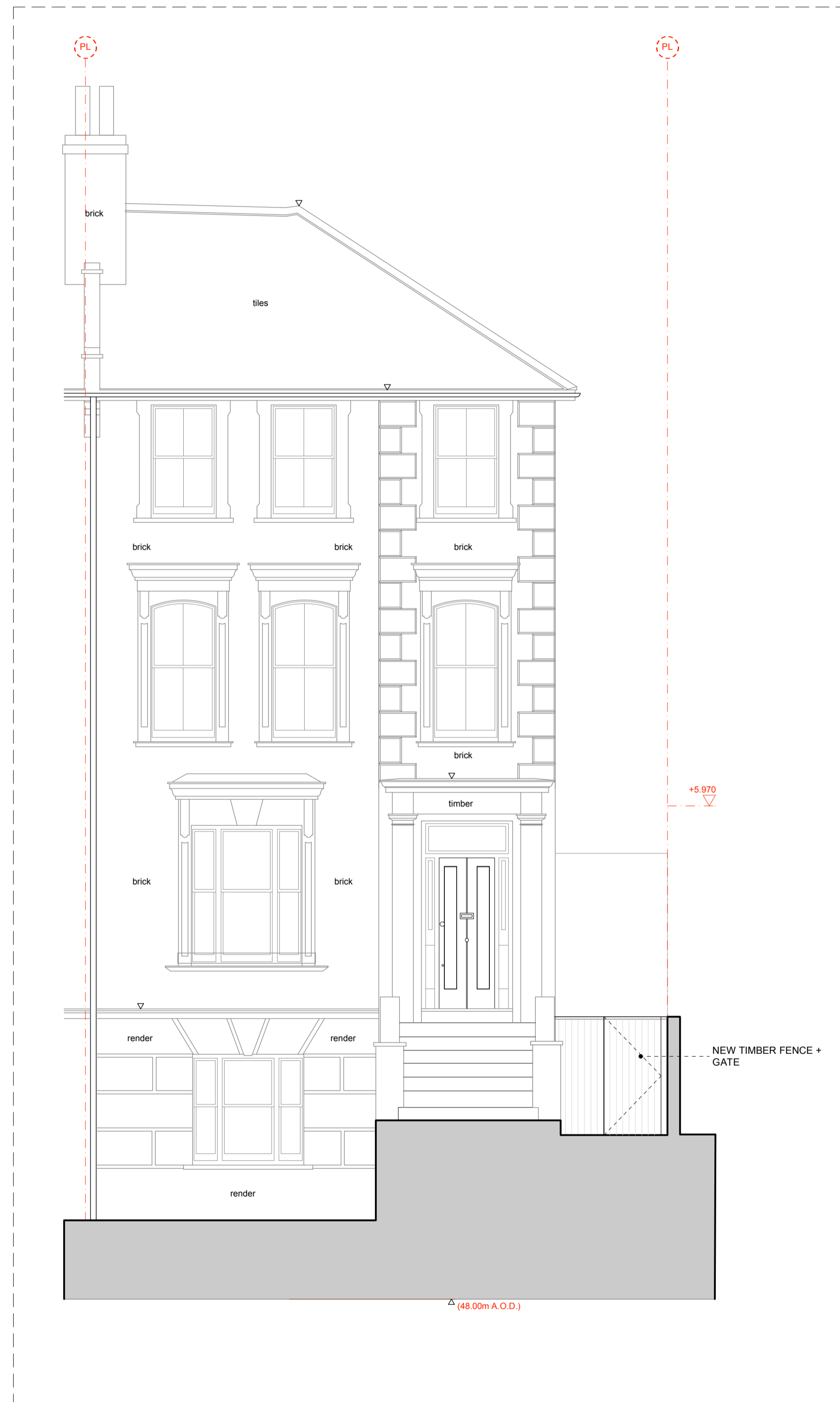
01 PROPOSED FRONT ELEVATION 1:50 @ A1, 1:100 @ A3

www.urbanprojectsbureau.com info@urbanprojectsbureau.com