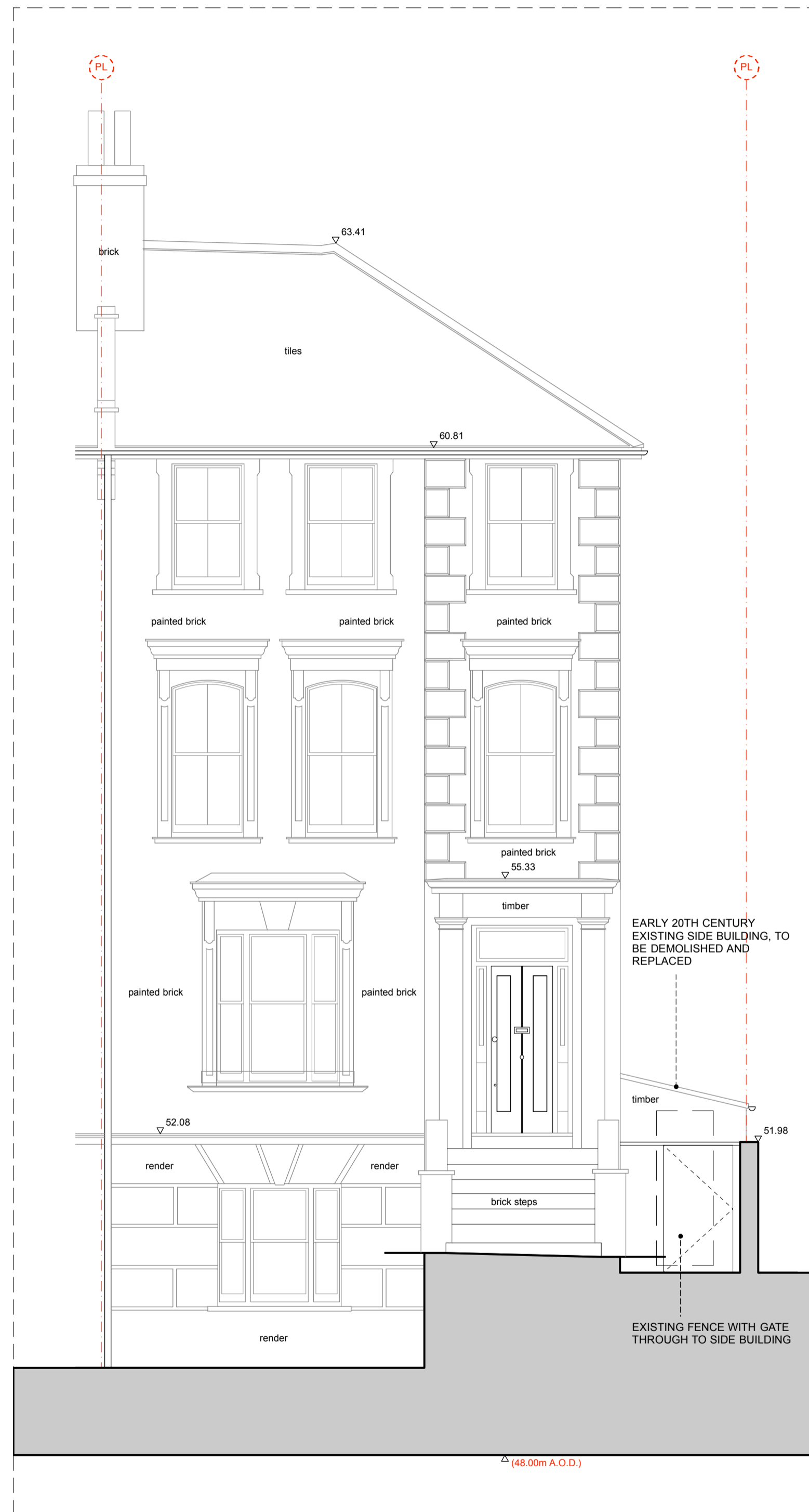
01 EXISTING FRONT ELEVATION 1:50 @ A1, 100 @ A3

www.urbanprojectsbureau.com info@urbanprojectsbureau.com