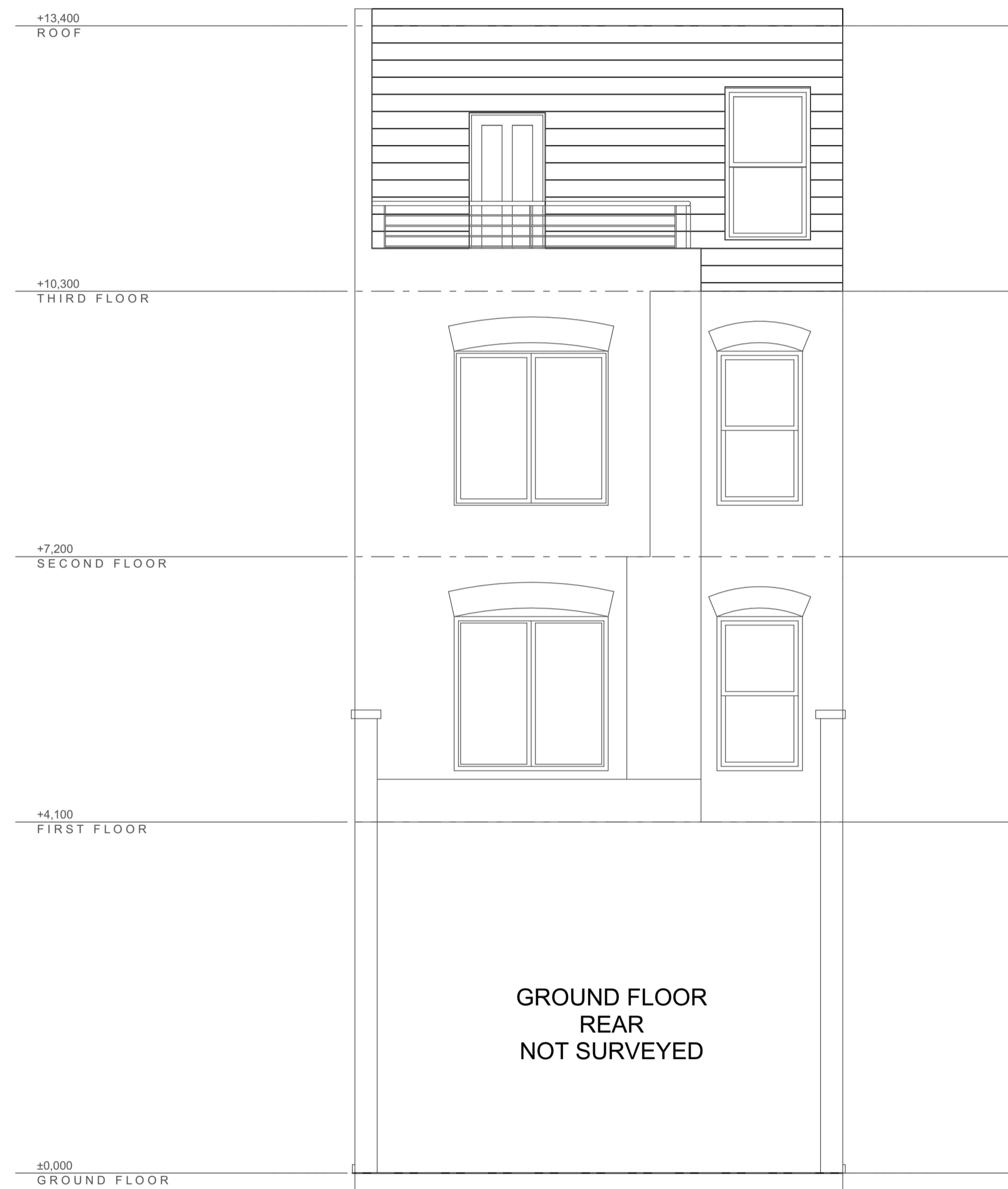
PROPOSED REAR ELEVATION 1:50