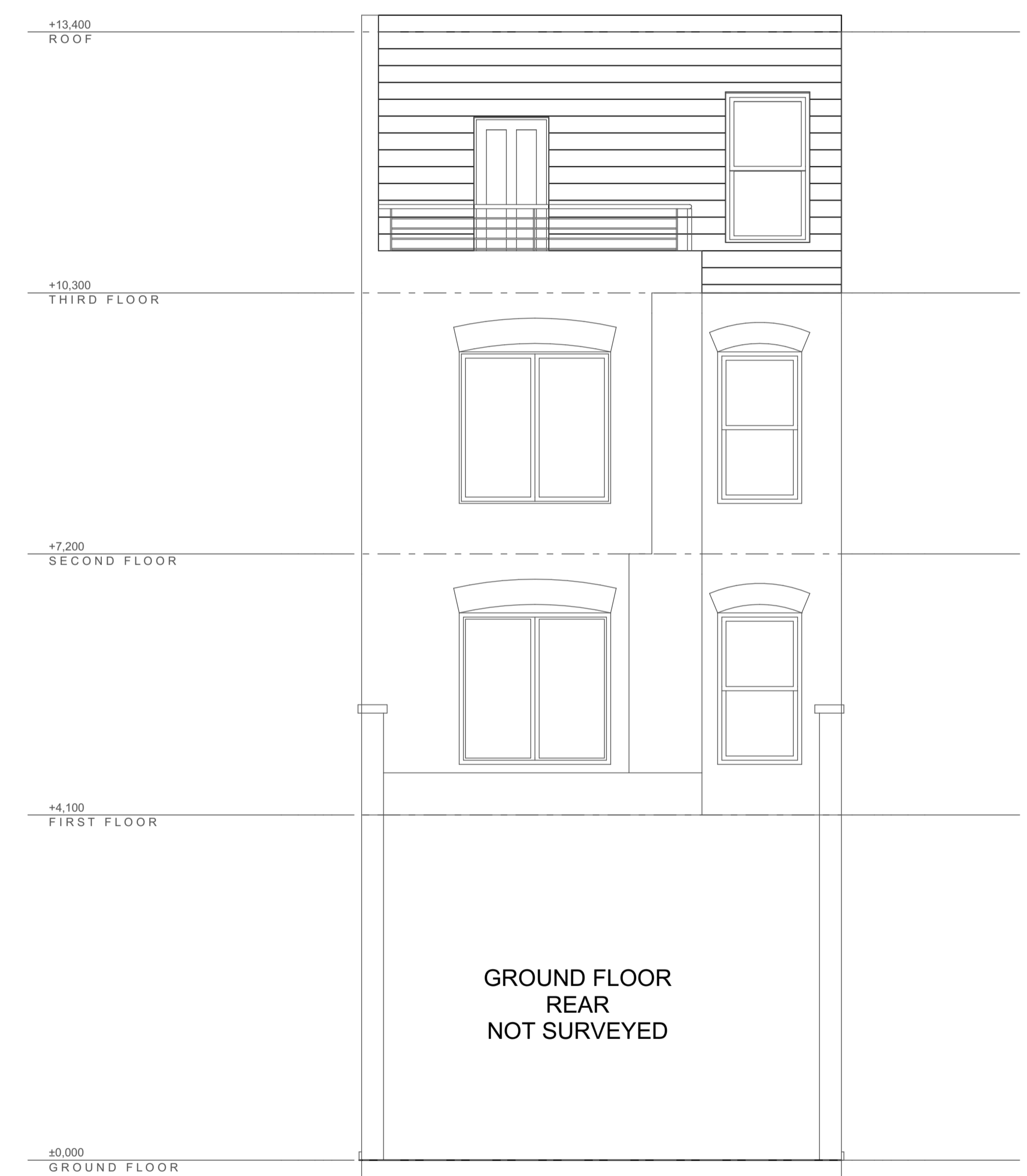
EXISTING REAR ELEVATION 1:50