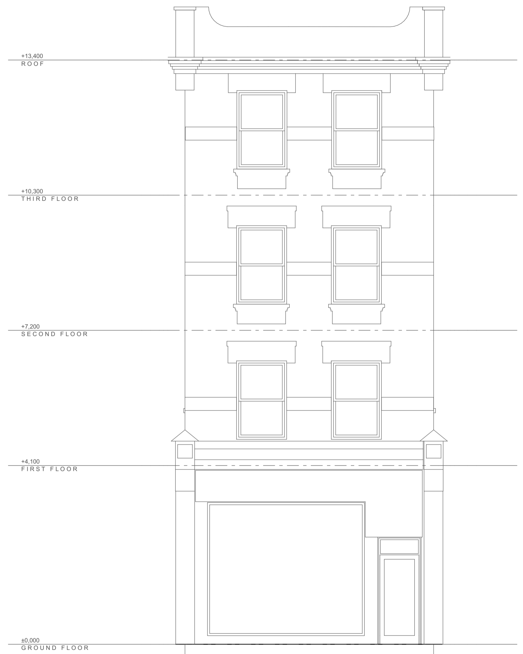
EXISTING FRONT ELEVATION 1:50