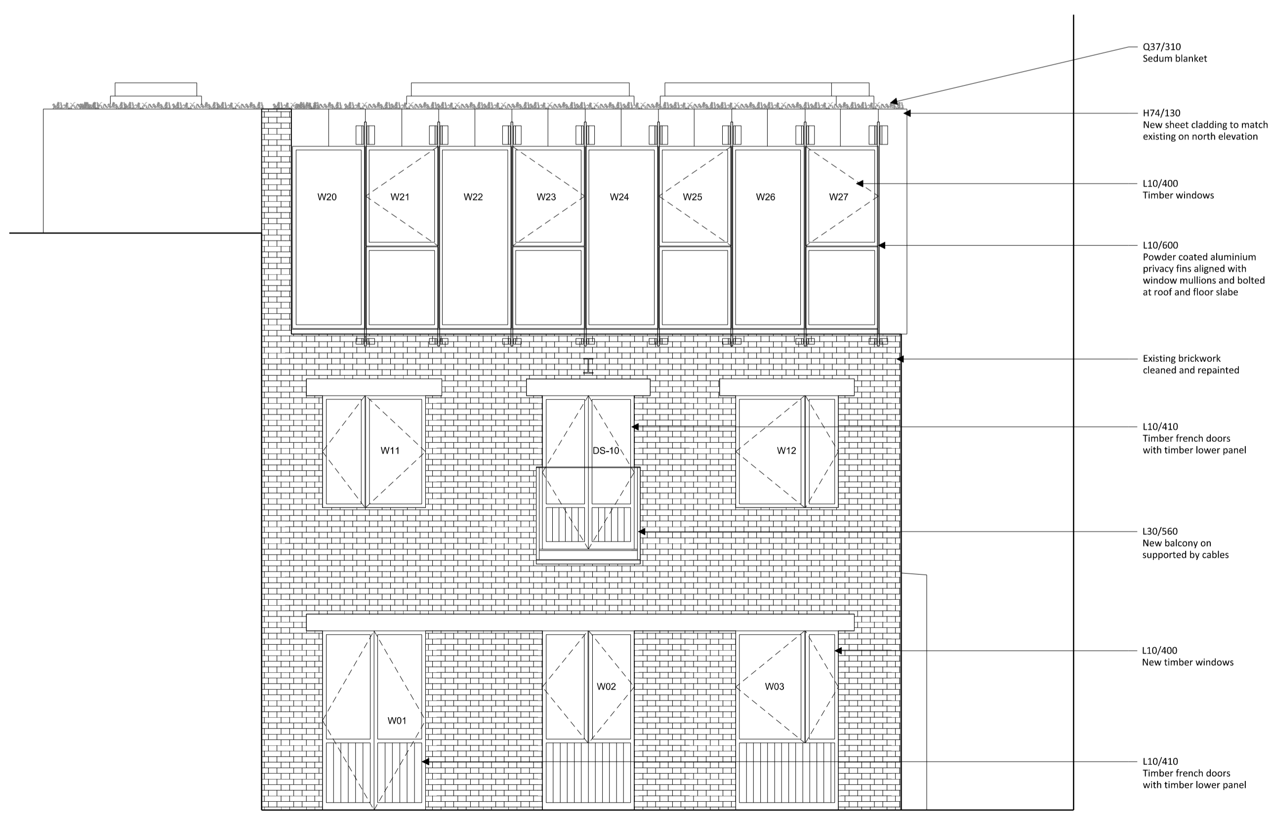
1 East elevation as proposed 202_350 Scale 1:50 @ A1