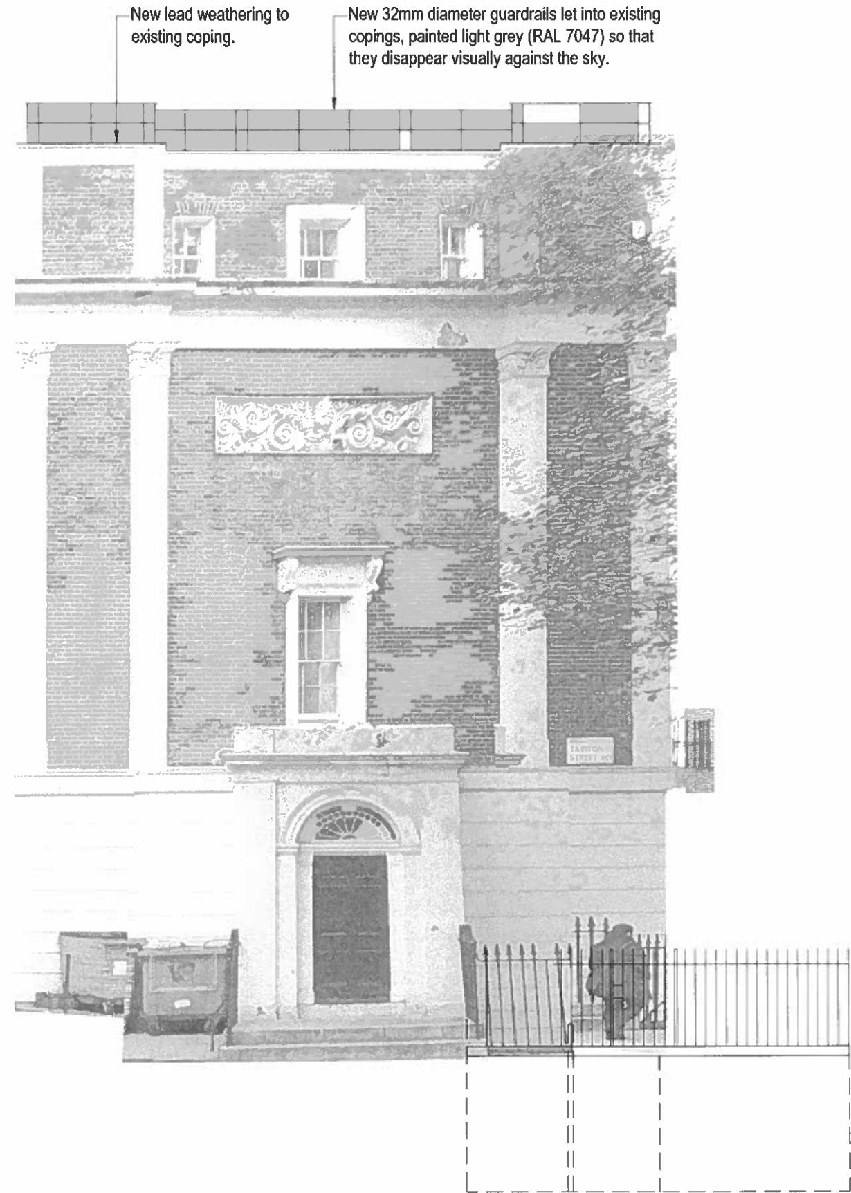
NO. 1 END ELEVATION TO TERRACE