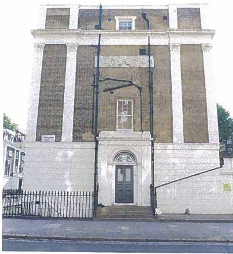
Photo 3: Passfield Halls Main Building Number 7 from Endsleigh Street