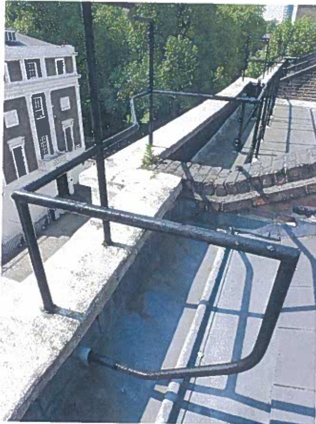
Photo 5: Passfield Halls Main Building: Existing guardrail to Numbers 2, 3, 4 and part of 5. (Note that guardrails to Number 4 let into asphalt roof are to be retained).