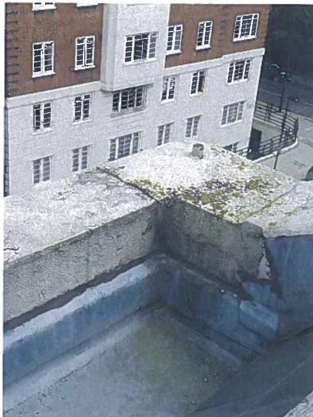
Photo 12: Endsleigh Annex Front Elevation: Metal balusters from previous guardrail are still evident.