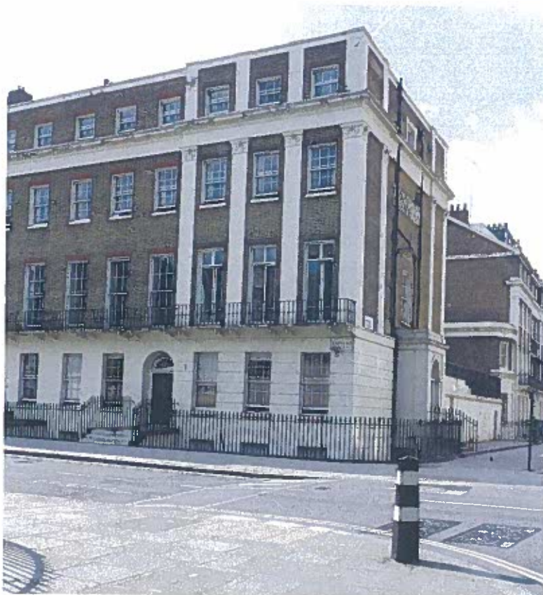
Photo 4: Passfield Halls Main Building: No.6 and 7 from Endsleigh Place