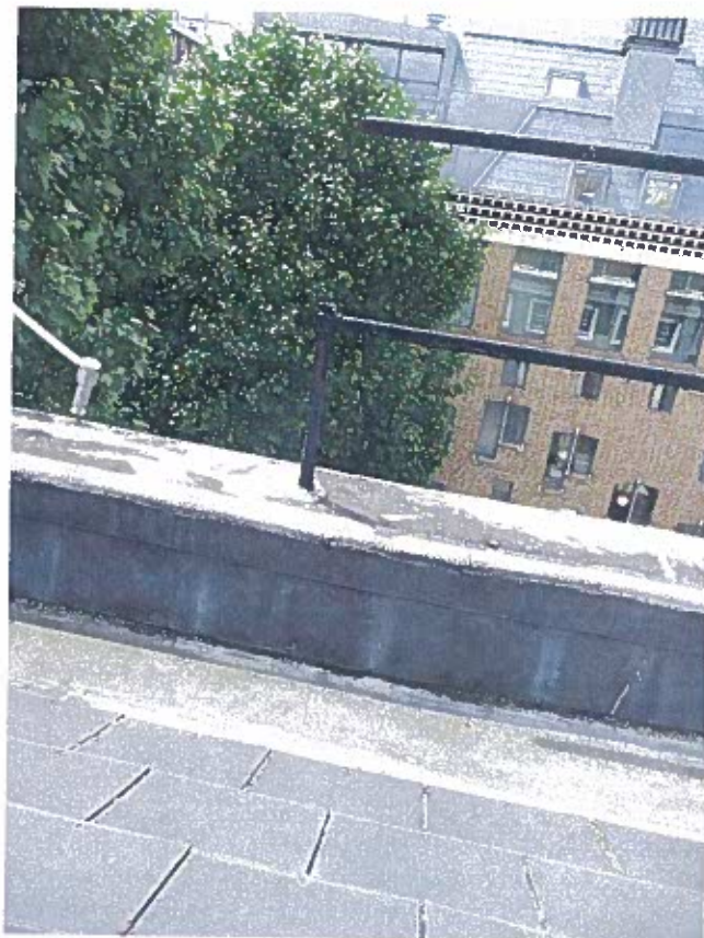
Photo 8: Taviton Annex: Existing broken section of guardrail to front elevation