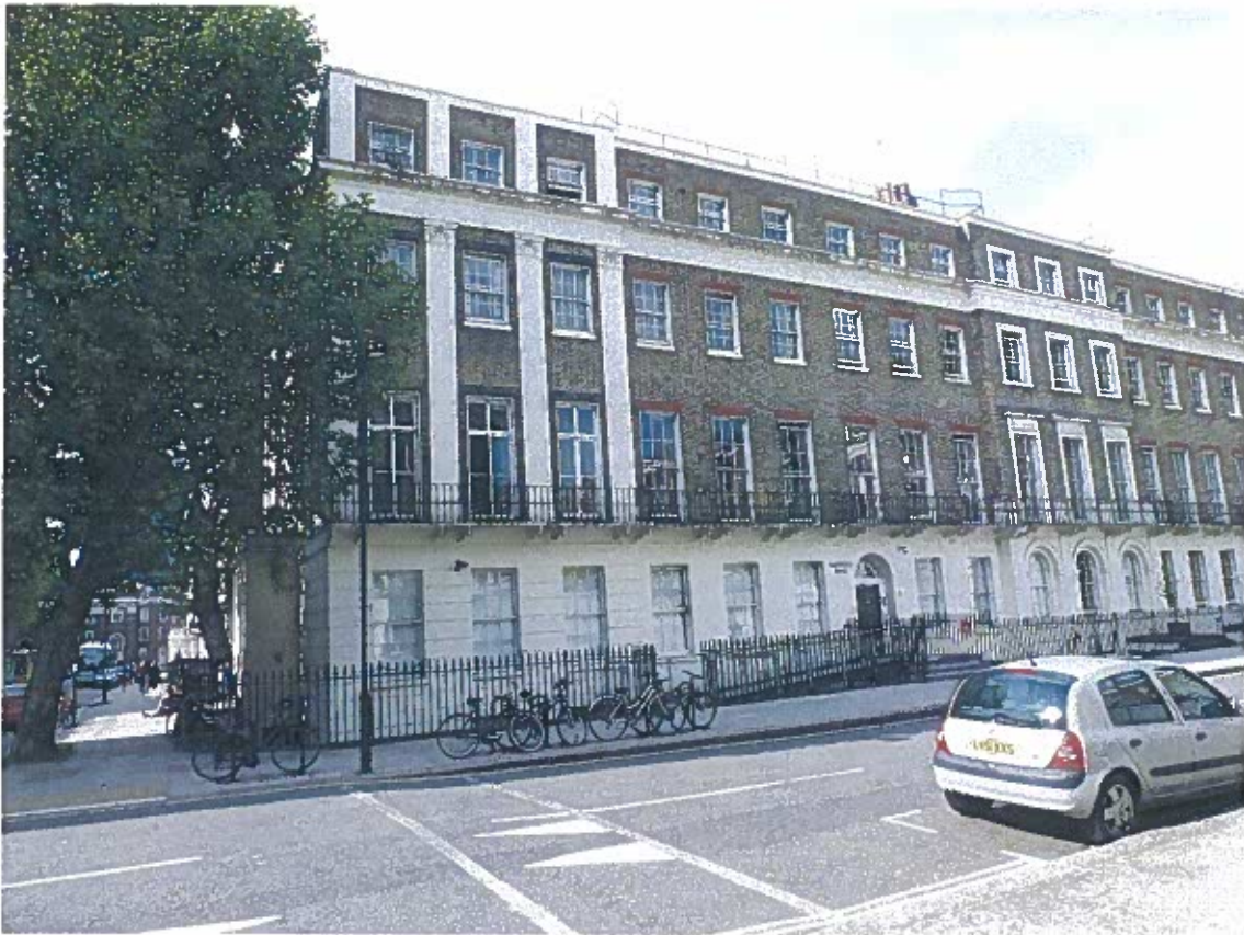
Photo 1: Passfield Halls Main Building Nos 1-5 inclusive. (Note existing guardrail to Numbers 2, 3 and 4).