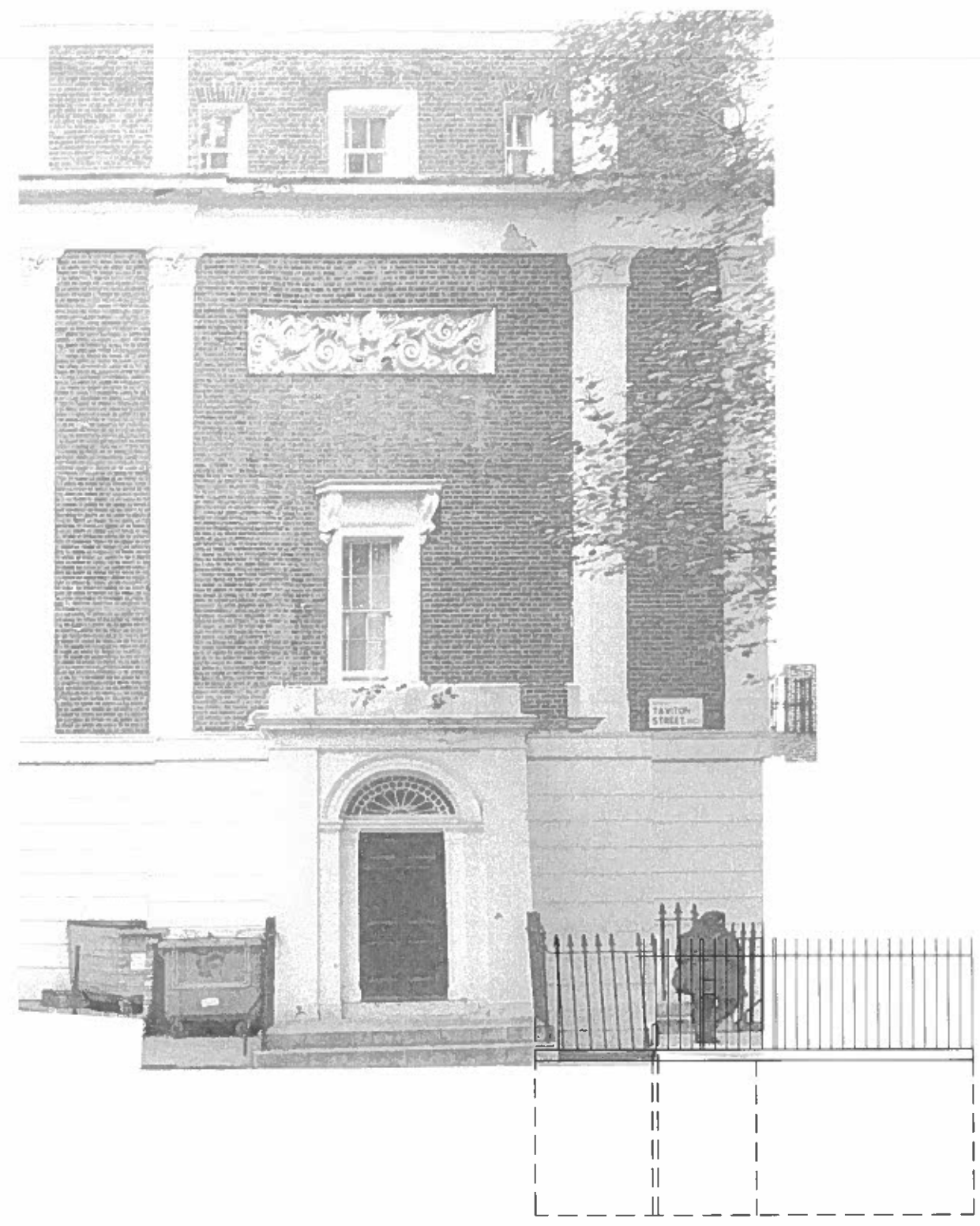
NO. 1 END ELEVATION TO TERRACE