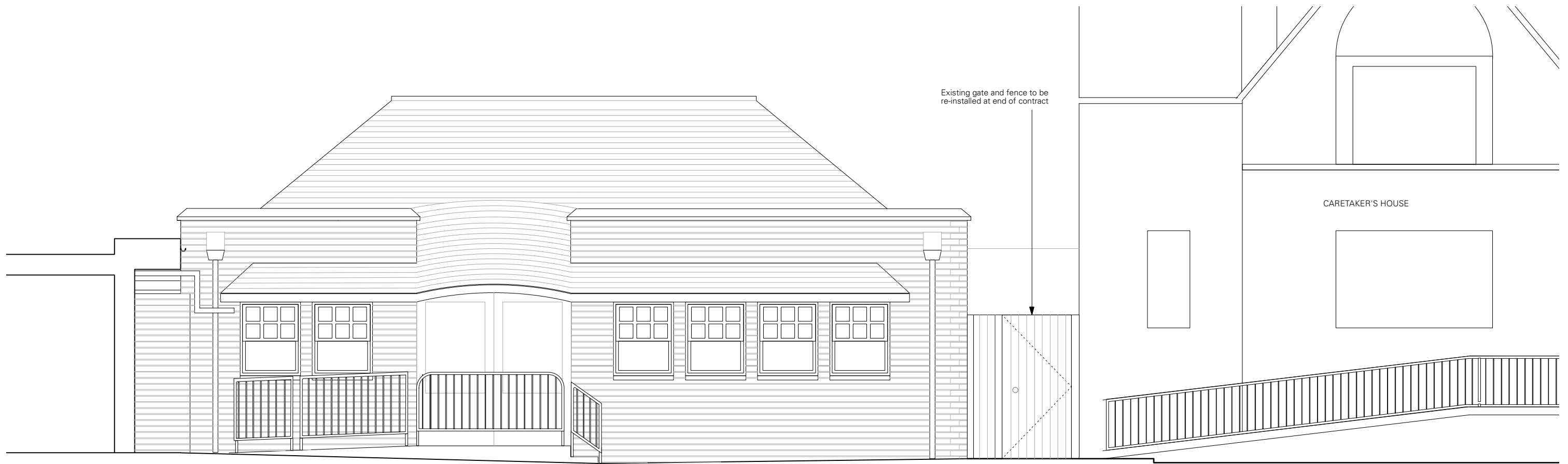
1 Proposed Elevation A-A - No Works Proposed East Elevation