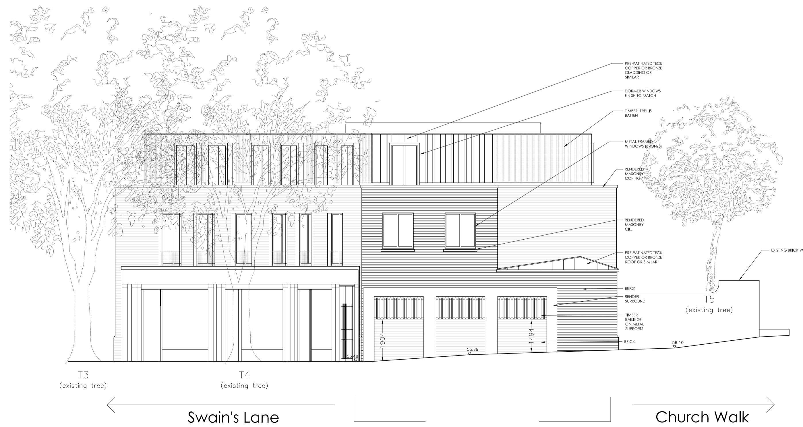
EAST BUILDING EAST ELEVATION ( Church Walk )