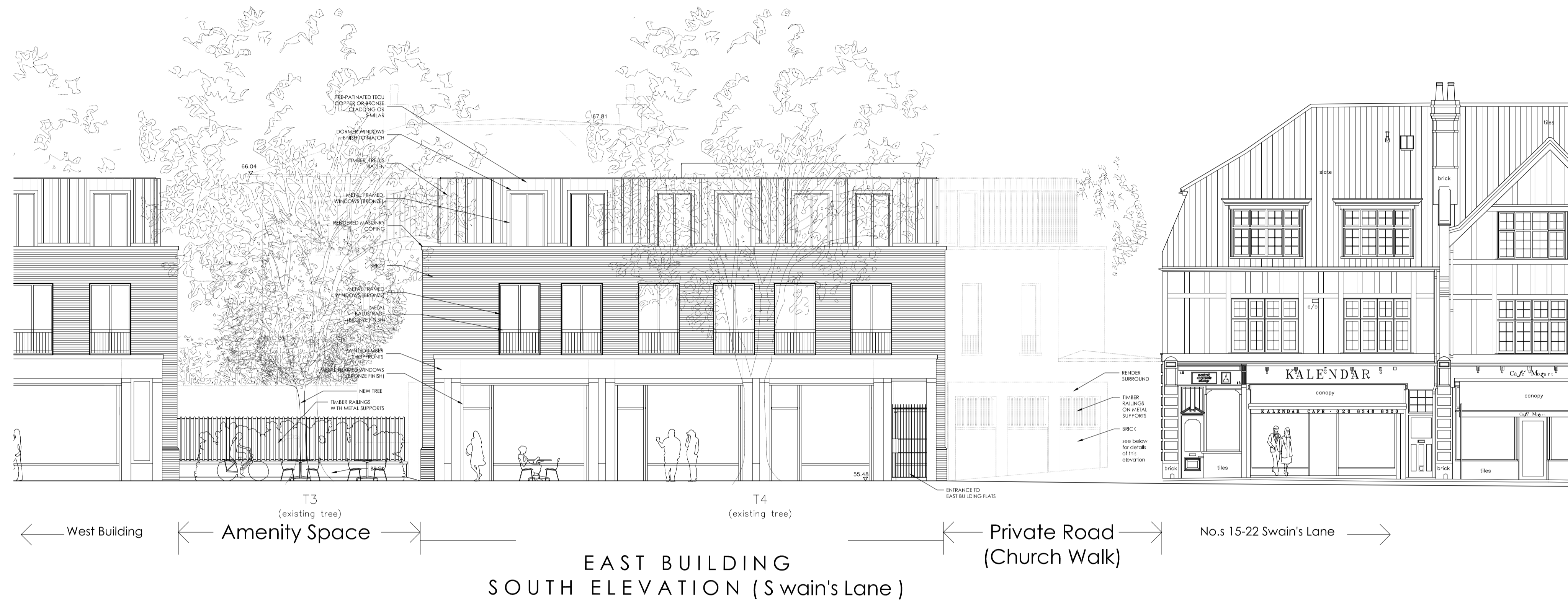
EAST BUILDING SOUTH ELEVATION ( Swain's Lane )