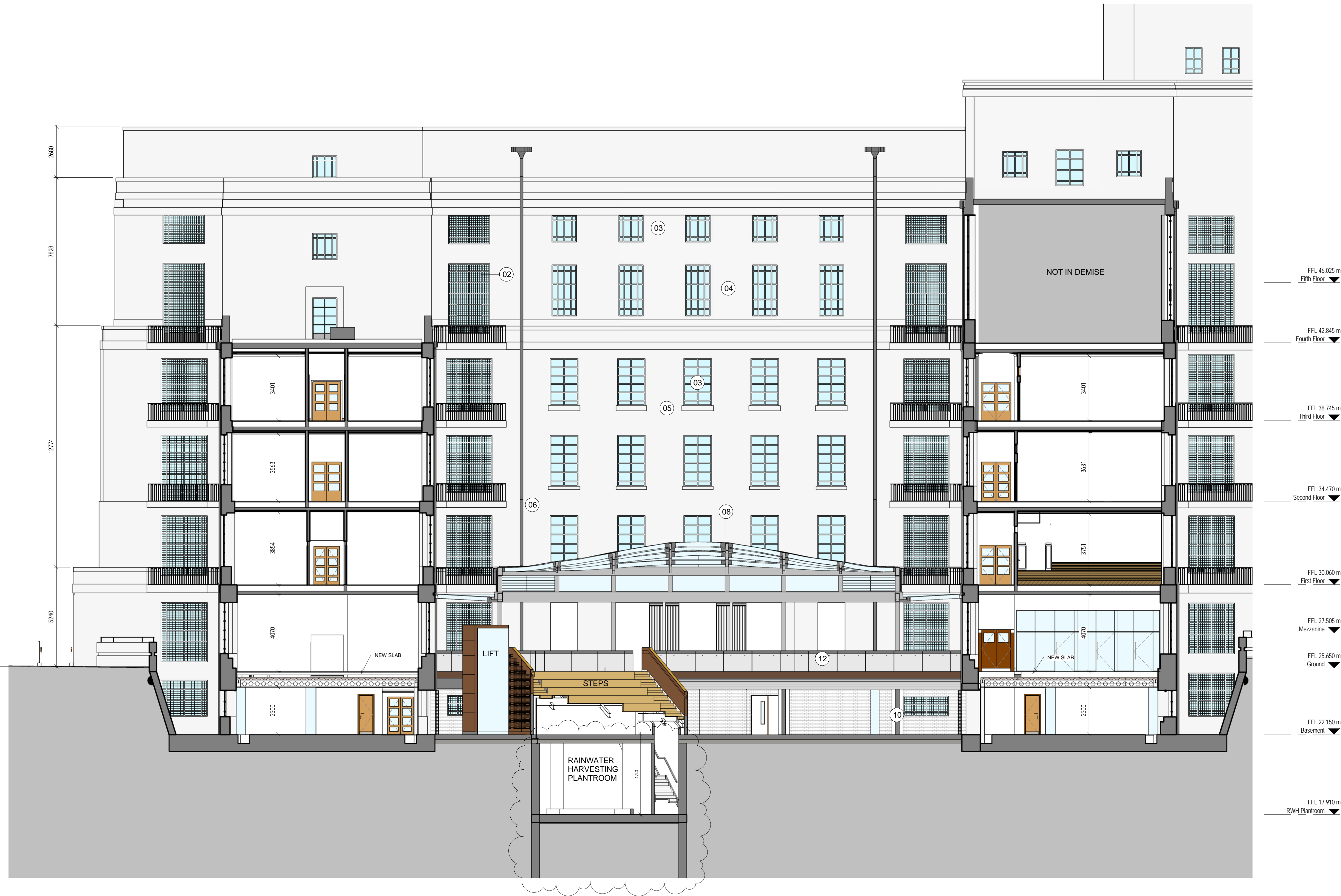
1 SECTION 2 PROPOSED 1 : 100

© COPYRIGHT Mace Group NOT TO BE REPRODUCED WITHOUT WRITTEN PERMISSION. BECAUSE OF POSSIBLE SCALING ERRORS IN ELECTRONIC AND HARD COPY REPRODUCTION DO NOT SCALE FOR CONSTRUCTION PURPOSES. ALL DIMENSIONS TO BE CHECKED & VERIFIED ON SITE PRIOR TO CONSTRUCTION.