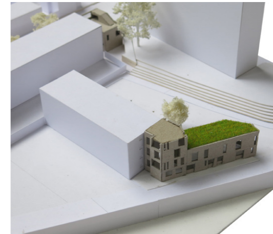
Sites 2 & 3