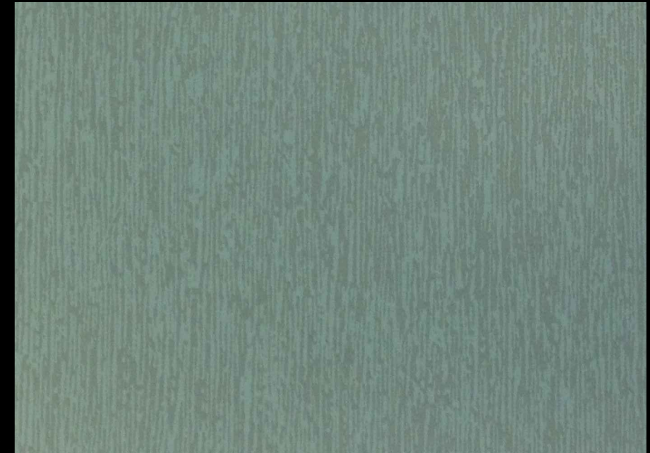
Hughes Parry Tower: Mansard

Wienerberger pagus Red with Tarmac Y113 medium buff mortar with a flush joint