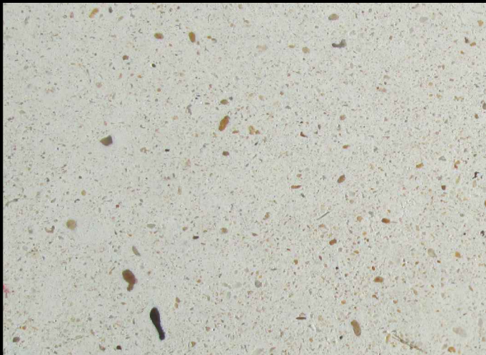
Sandwich Street Townhouse: Cast Stone

Wienerberger Ashley Red Multi Jointing to be flush with a natural mortar