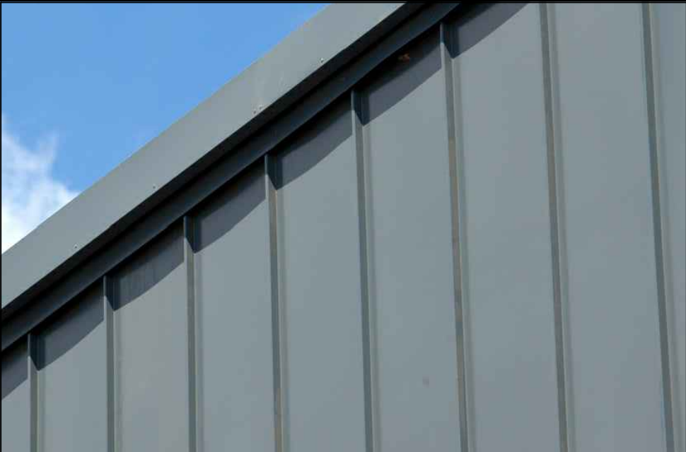
Sandwich Street Townhouse: Mansard

Cast stone to all sills, soffits and stone facades with an aggregate mix of wet-cast concrete mix of Cotswold gravel and a 50%:50% mix of Cotswold and Dolomite sands and white cement with an acid etched surface finish