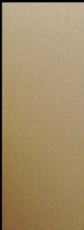
Unpolished Bronze 39 504