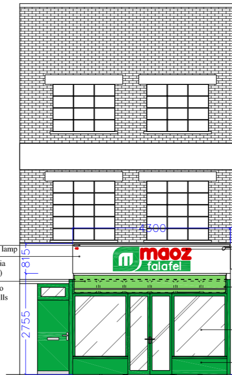
FRONT ELEVATION (as proposed)

internally illuminated projecting sign retractable red colour canopy timber frame grill above main entrance timber framed door and windows grey panel below window