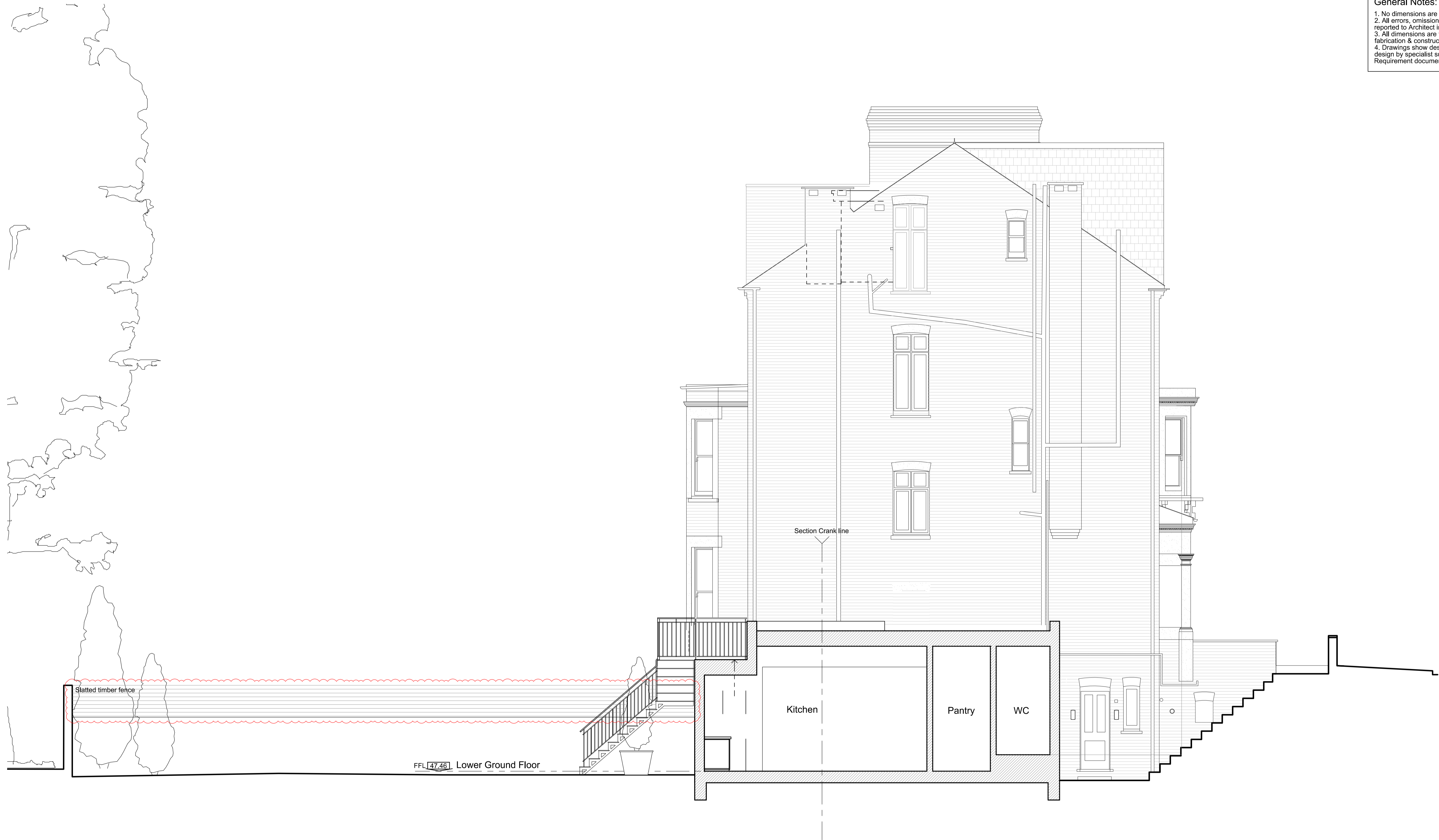
B Proposed Section B-B

General Notes: 1. No dimensions are to be scaled from this drawing. 2. All errors, omissions or inconsistencies are to be reported to Architect immediately. 3. All dimensions are to be checked on site prior to fabrication & construction. 4. Drawings show design intent only, detail & fabrication design by specialist sub-contractor. Refer to Employer's Requirement documentation