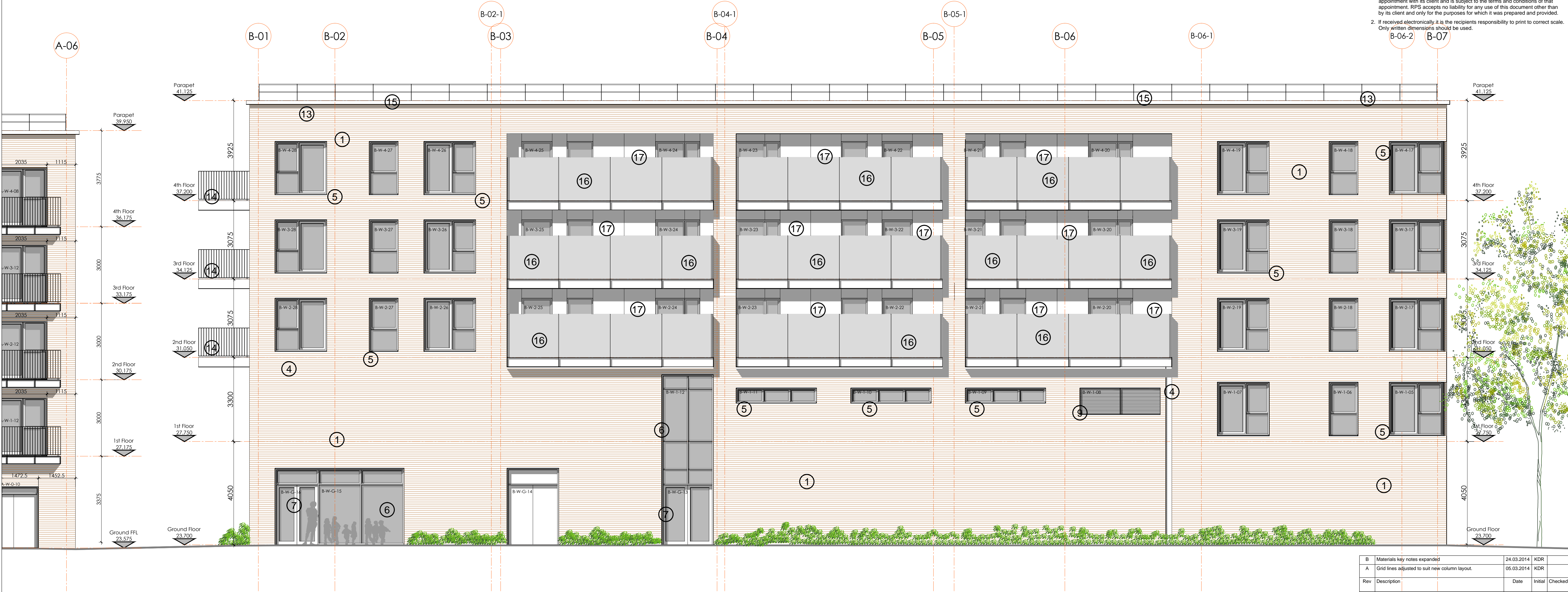
Plender Street B South Elevation Proposed