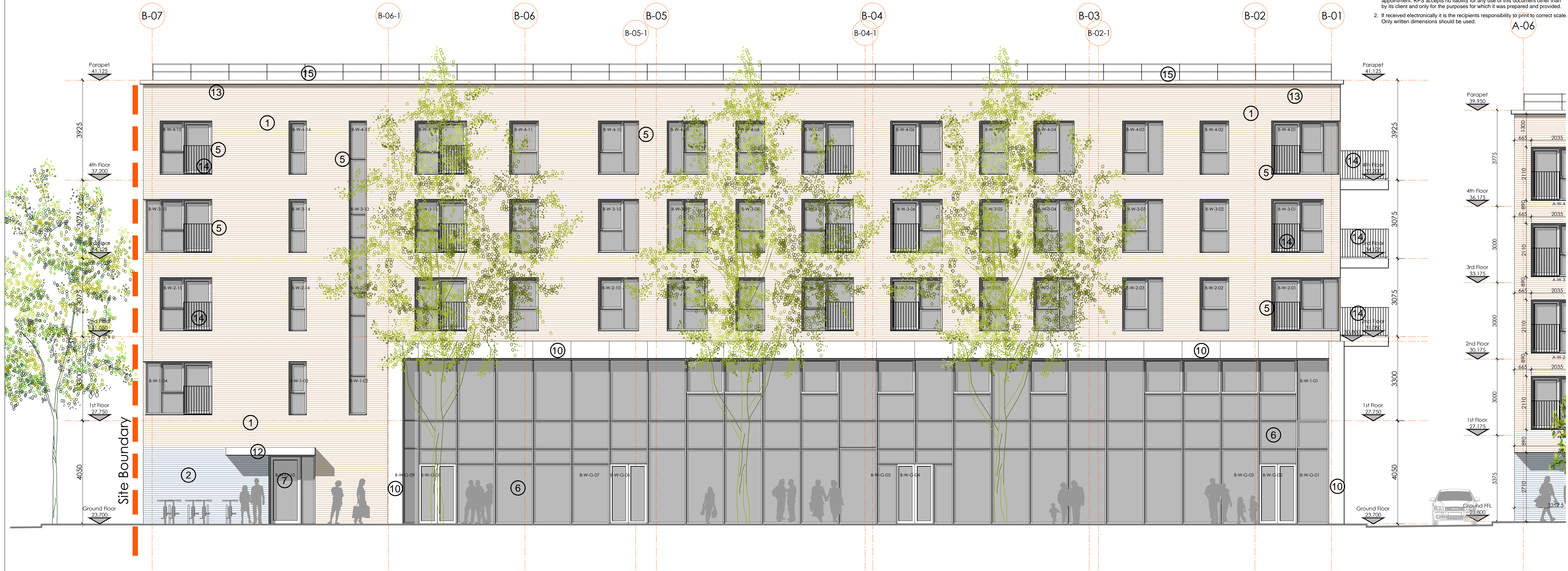
Plender Street B North Elevation Proposed