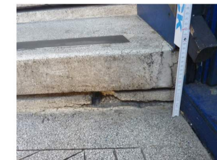
7 WESTERN EXTERNAL STAIRCASE DAMAGED TREAD EDGES