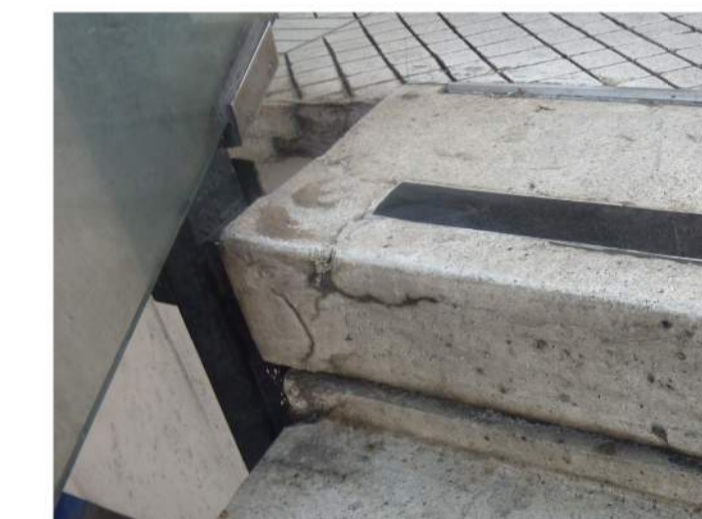
6 WESTERN EXTERNAL STAIRCASE EXISTING REPAIRS