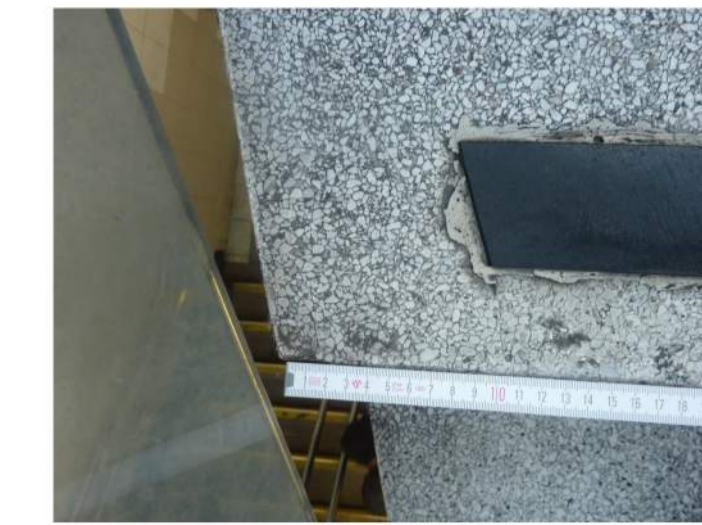
4 WESTERN EXTERNAL STAIRCASE NOSING STRIP