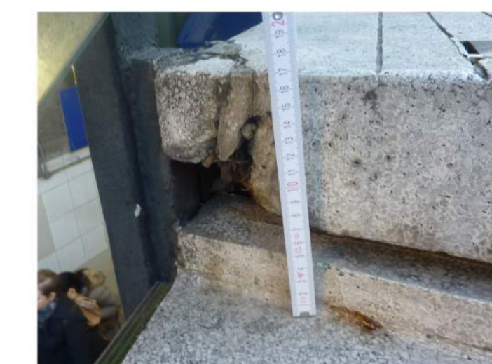
8 WESTERN EXTERNAL STAIRCASE DAMAGED TREAD CORNERS