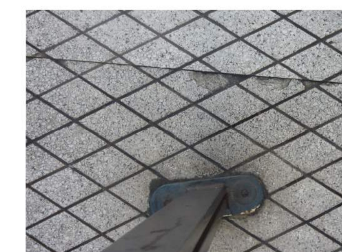
9 WESTERN EXTERNAL STAIRCASE HANDRAIL POST FIXING