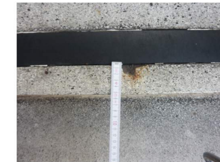
5 WESTERN EXTERNAL STAIRCASE RUST STAINING