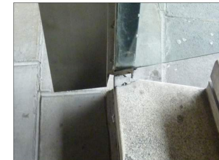
6 EASTERN EXTERNAL STAIRCASE EXISTING REPAIRS