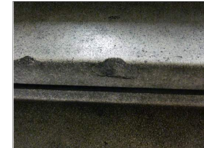
5 EASTERN EXTERNAL STAIRCASE RUST STAINING