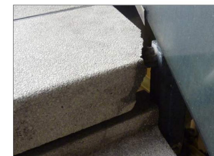
9 EASTERN EXTERNAL STAIRCASE HANDRAIL POST FIXING