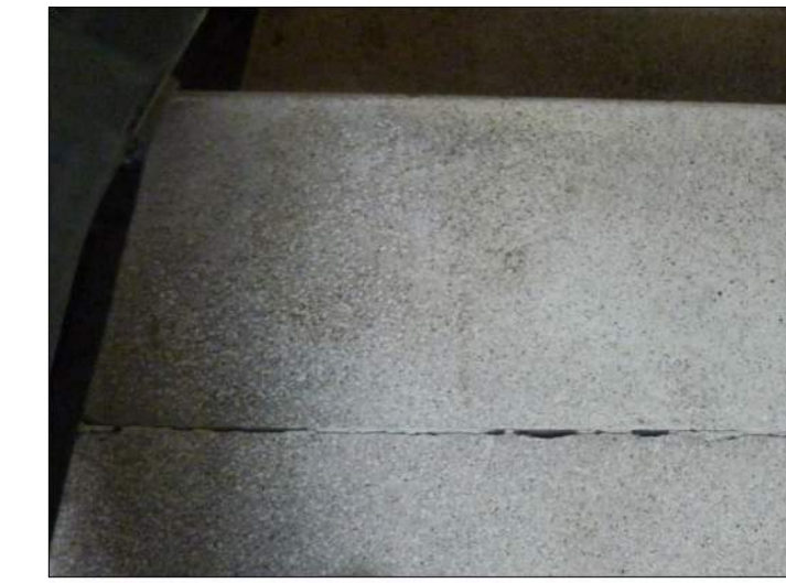
4 EASTERN EXTERNAL STAIRCASE NOSING STRIP

Minor repairs to be made good. Existing treads and landings to refurbished as L30/270B