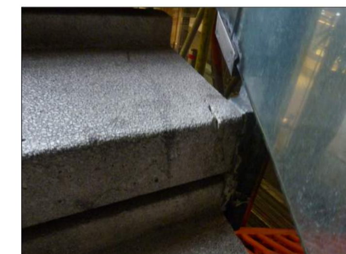
8 EASTERN EXTERNAL STAIRCASE DAMAGED TREAD CORNERS