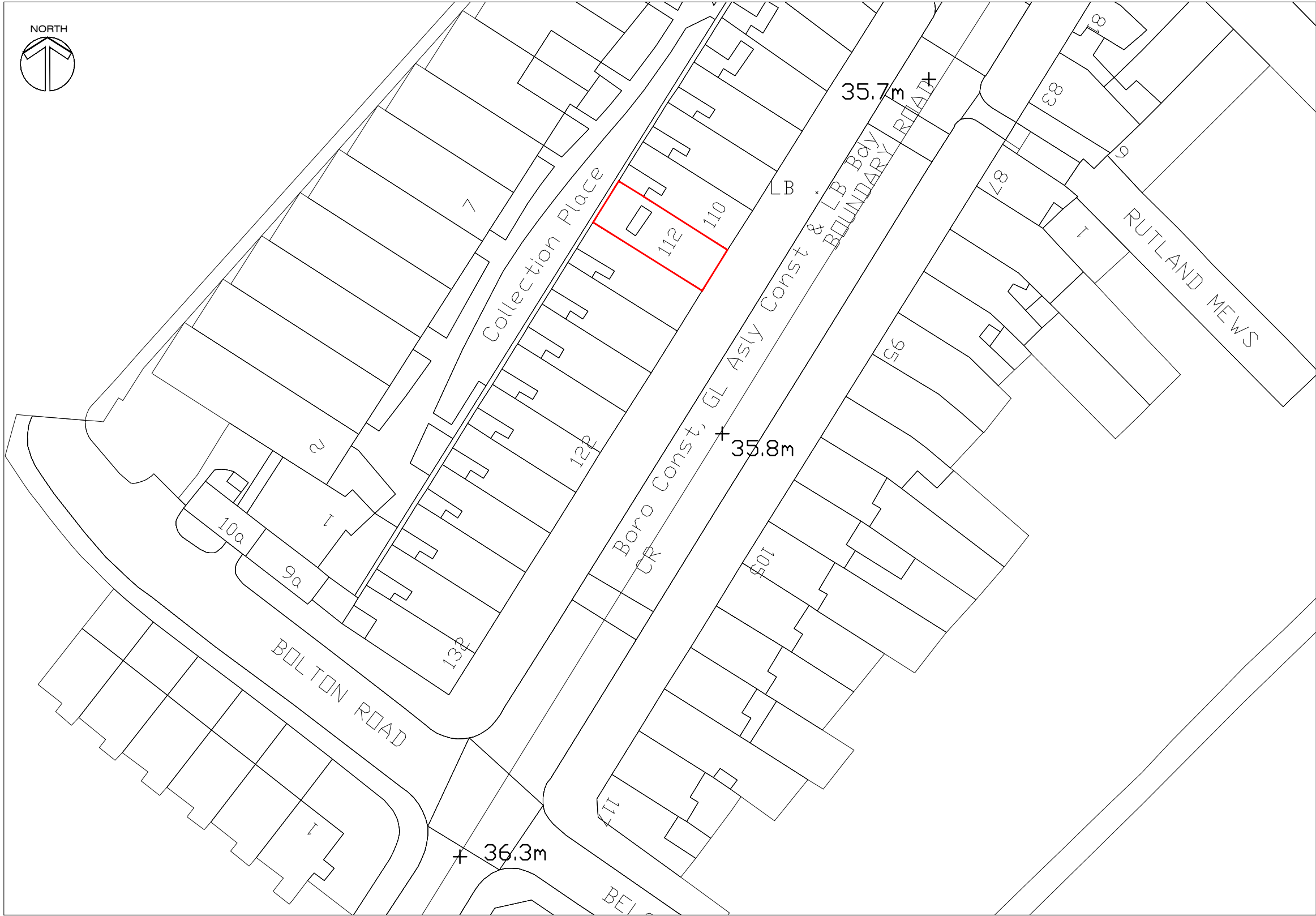
SITE LAYOUT SCALE 1=500