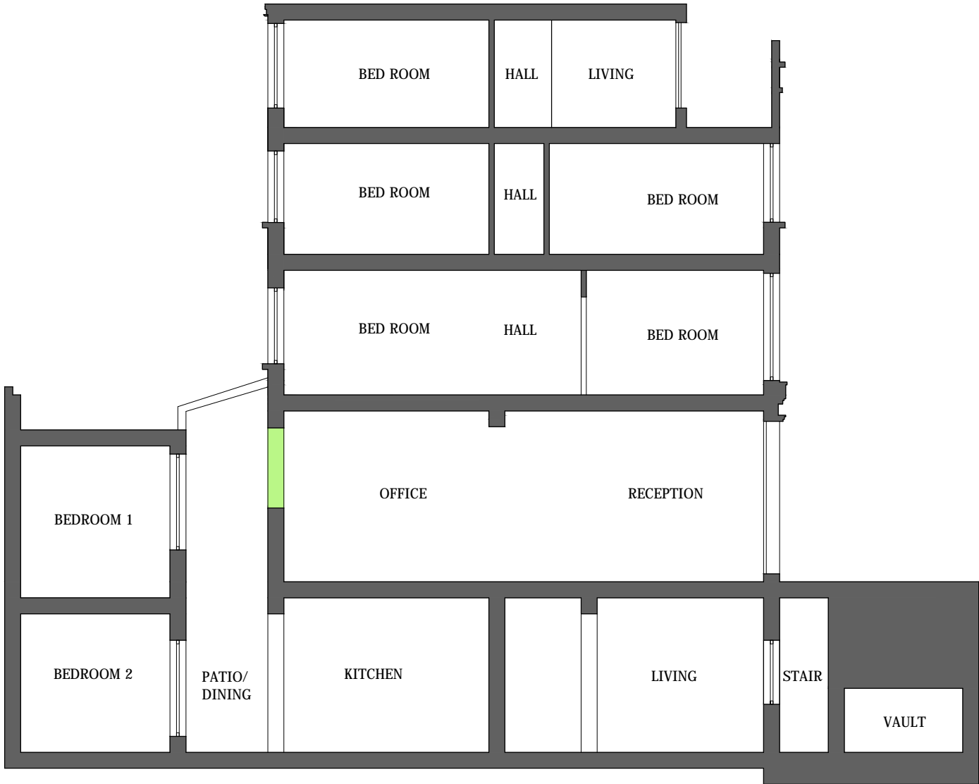
PROPOSED SECTION A-A