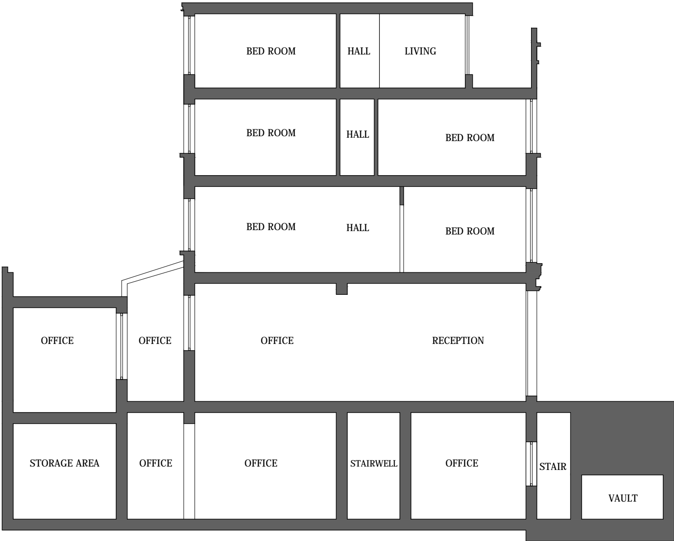
EXISTING SECTION A-A