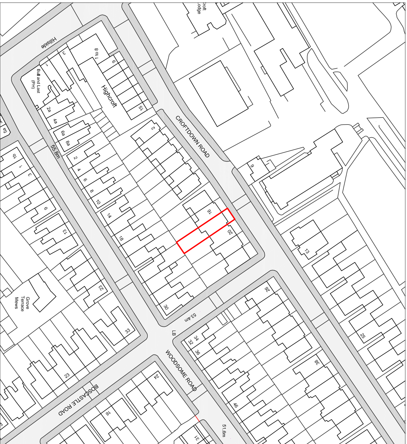
EXISTING SITE LOCATION PLAN SCALE 1:1250 0 20 50 100M