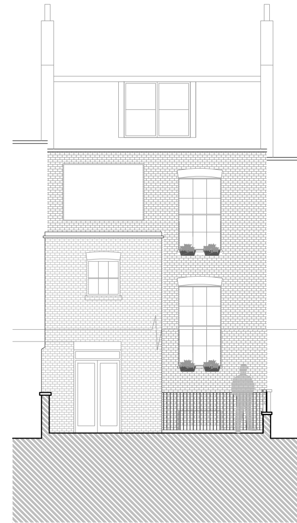
REAR ELEVATION E: 1/100