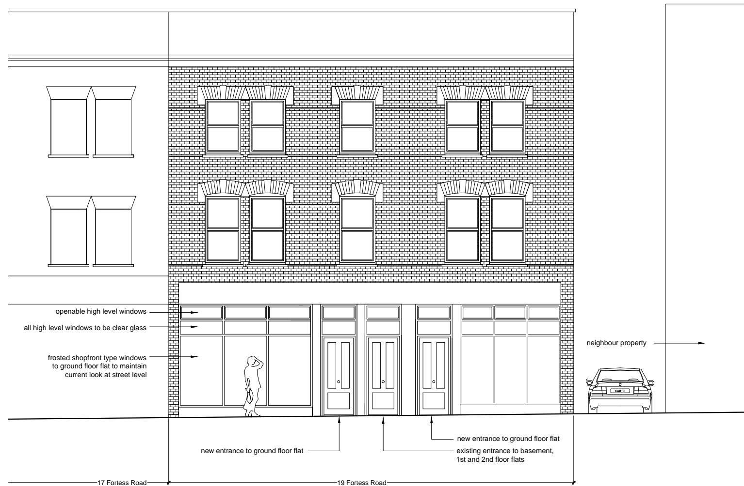
Proposed front elevation Scale 1:100 @A3