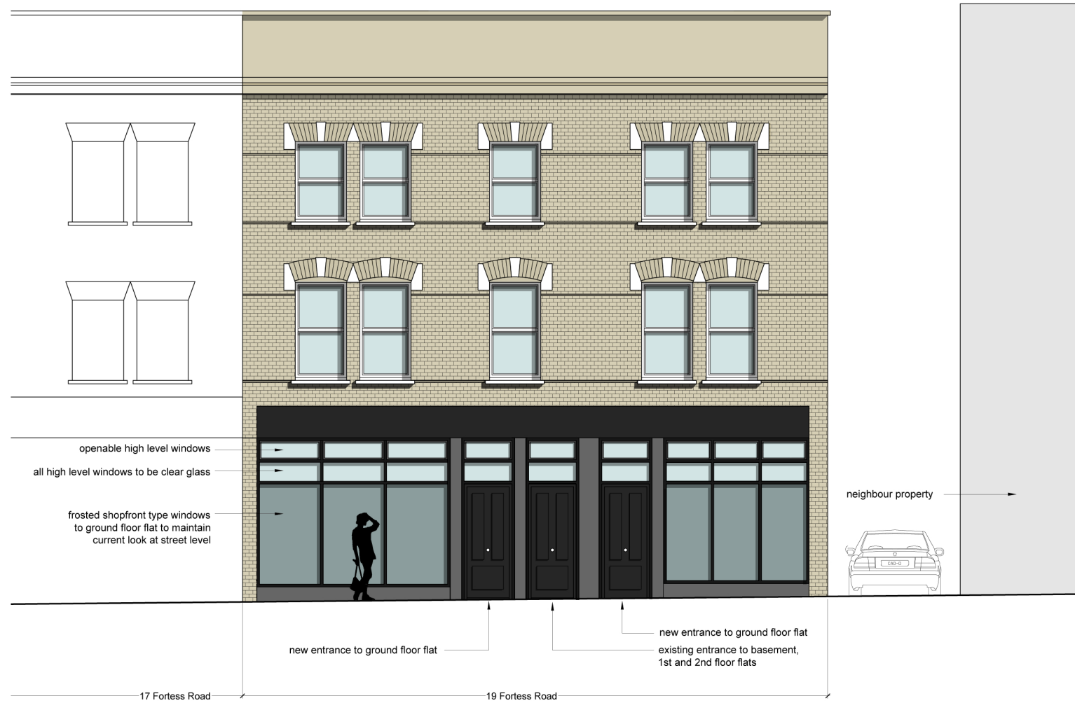
Proposed front elevation Scale 1:100 @A3