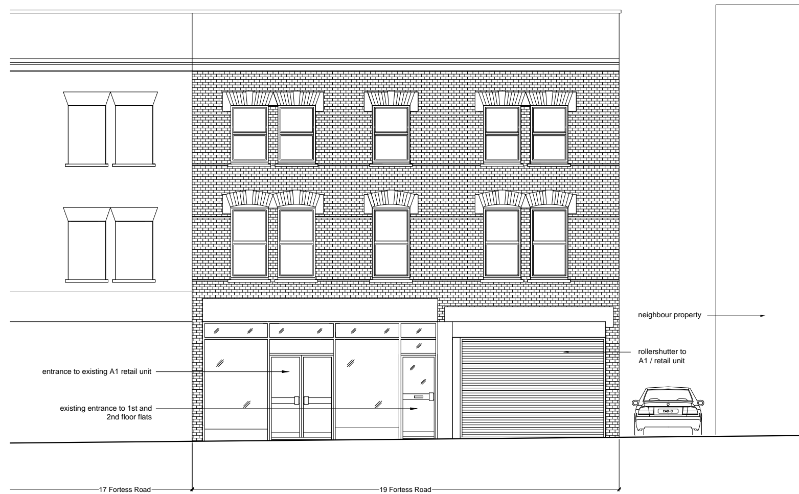
Existing front elevation Scale 1:100 @A3