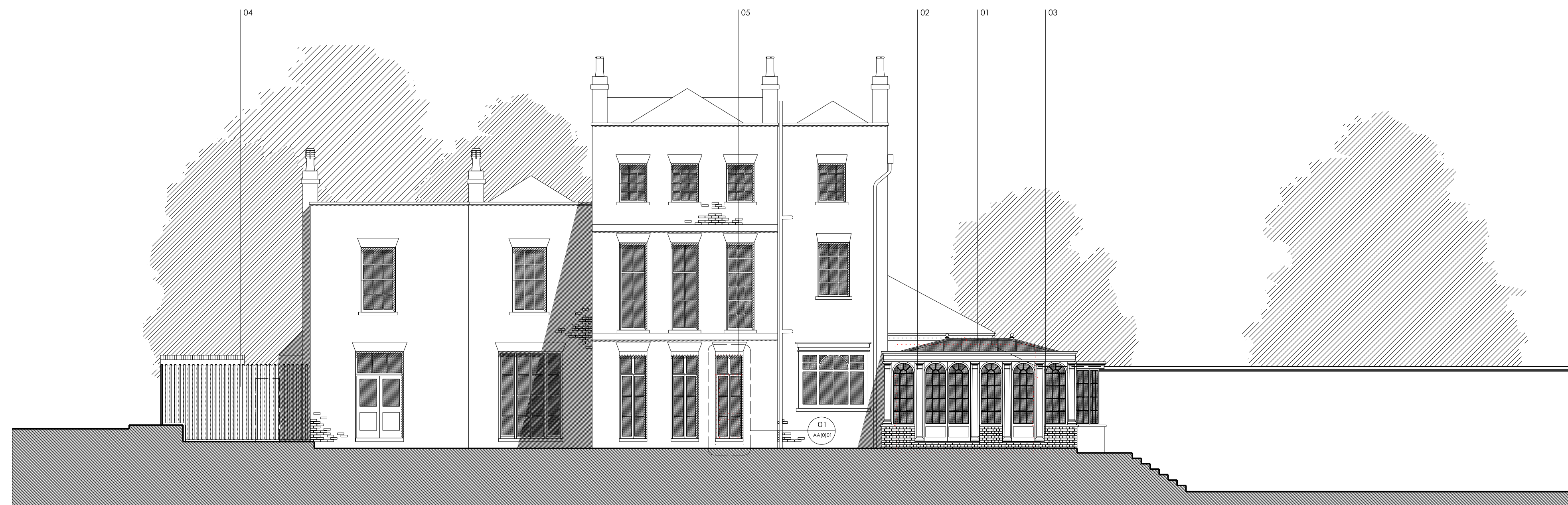
PROPOSED SOUTH-WEST ELEVATION