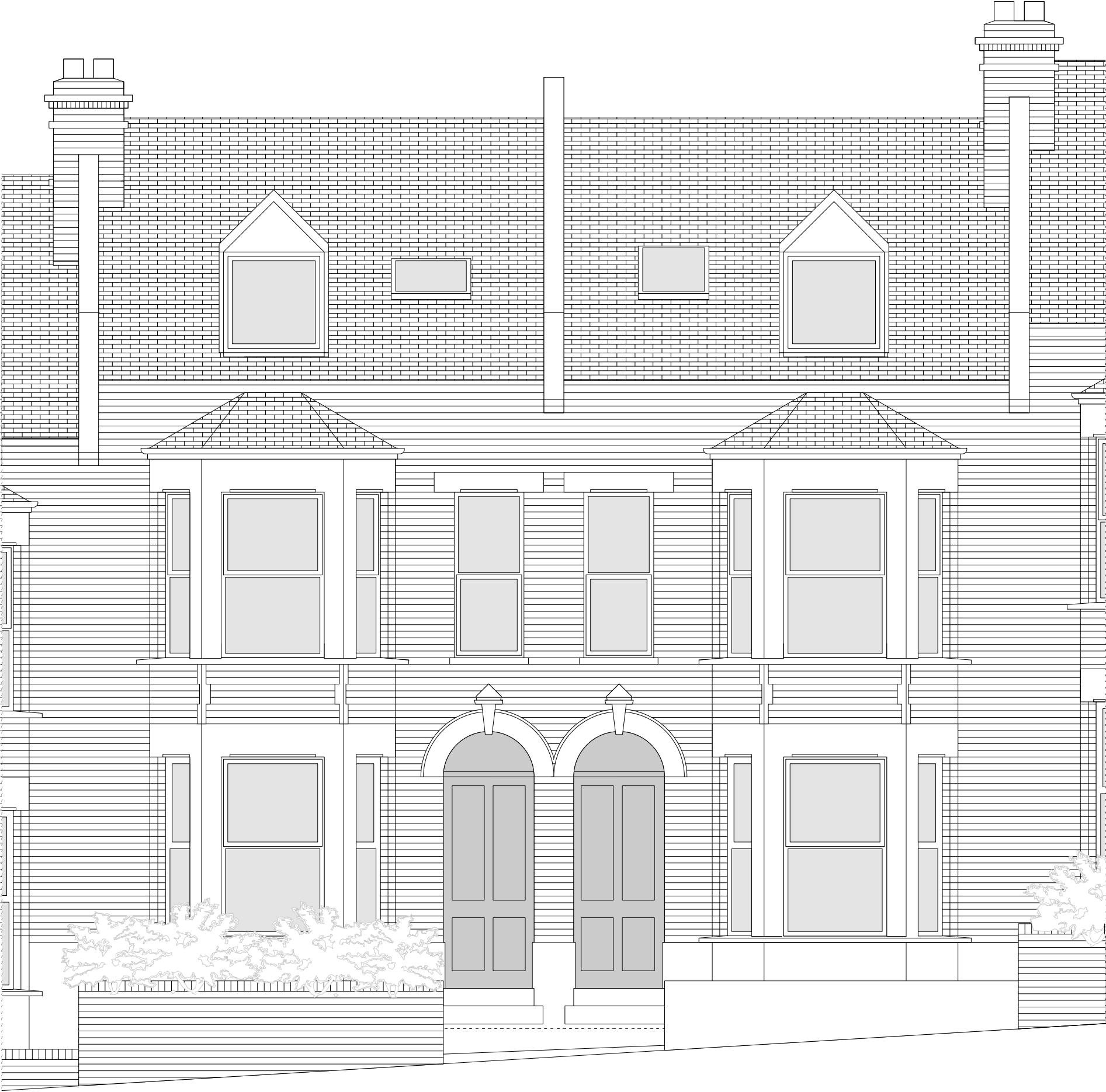
FRONT ELEVATION (SOUTH)