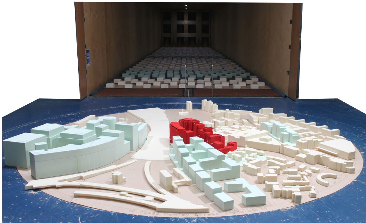
Figure 13: Proposed Development and Cumulative Surroundings including 101 and 103 Camley St (Configuration 3) – View in the Wind Tunnel (view from north)