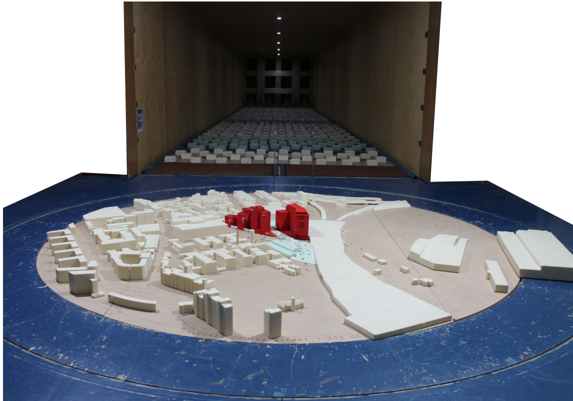
Figure 12: Proposed Development and Existing Surroundings including 103 Camley St (Configuration 2) – View in the Wind Tunnel (view from south)