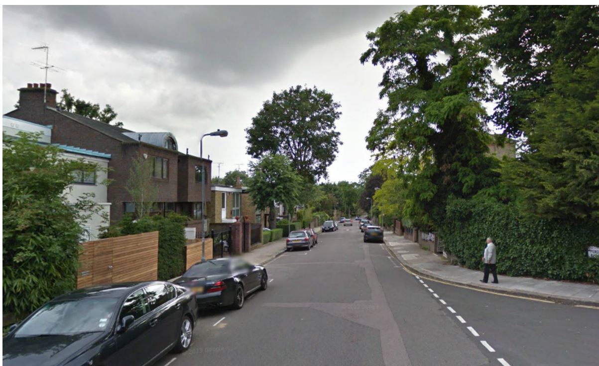
Views of Oran Road