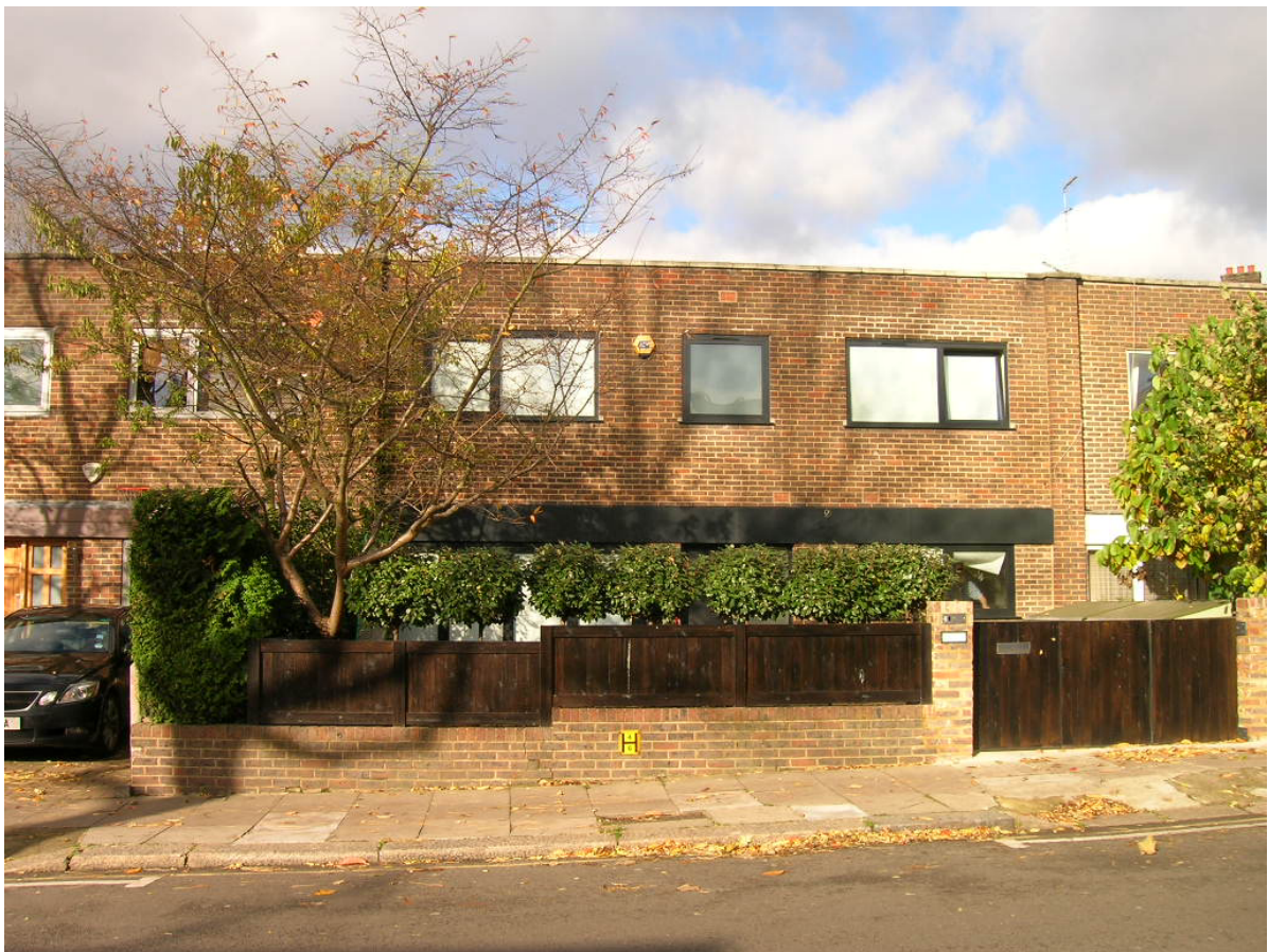
Front elevation of no. 28 in spring and winter.