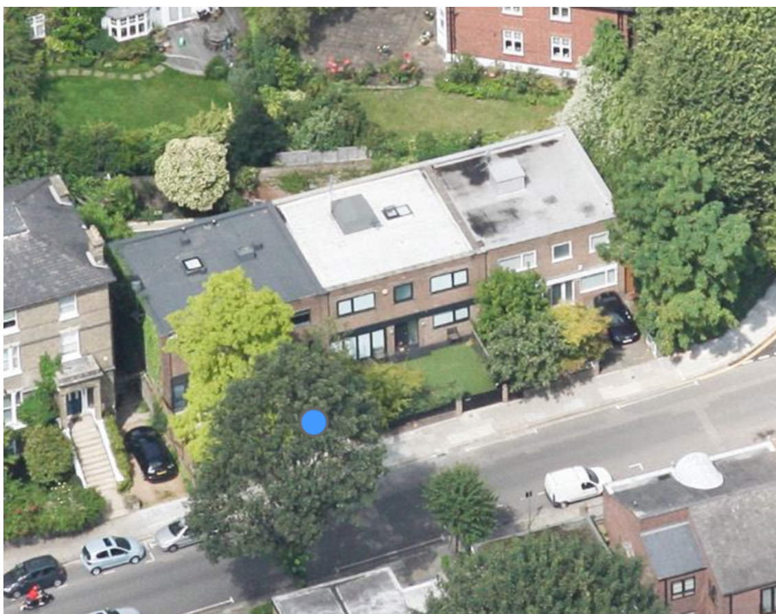
Aerials views of the terrace 26-30 Ornan Road. No. 28 is the middle one.