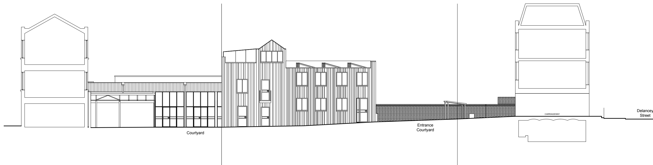
EXISTING WEST COURTYARD ELEVATION