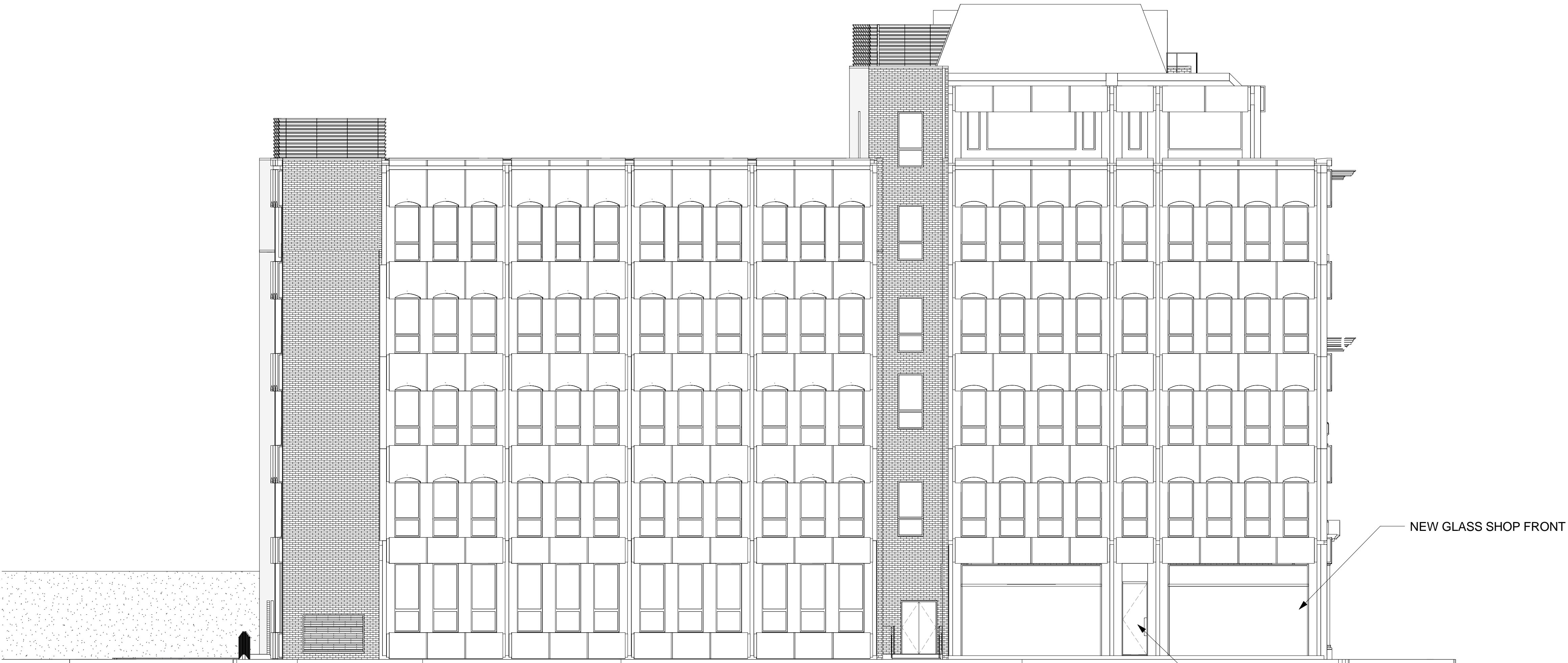
RETAIL UNIT - EAST ELEVATION (PROPOSED) 1 : 100