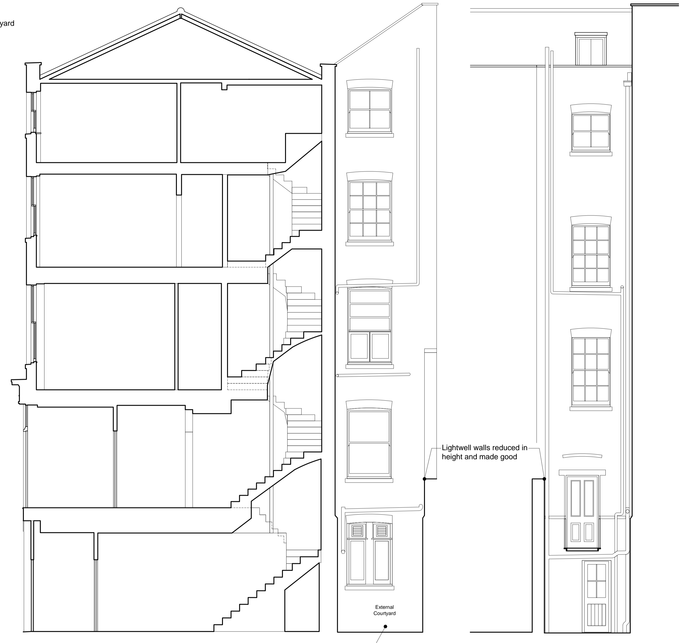
Proposed Section A_A