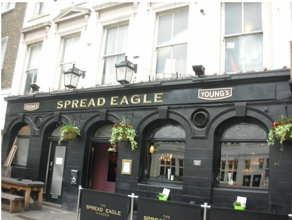
Photo B – Side elevation fascia sign “SPREAD EAGLE” approx. H280, W3900mm, projection 50mm. “YOUNG’S PLAQUE” approx. H280, W600mm.