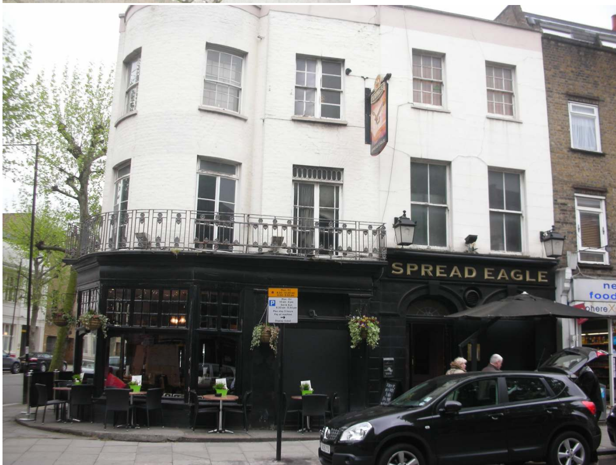
Photo J - North facing front elevation.