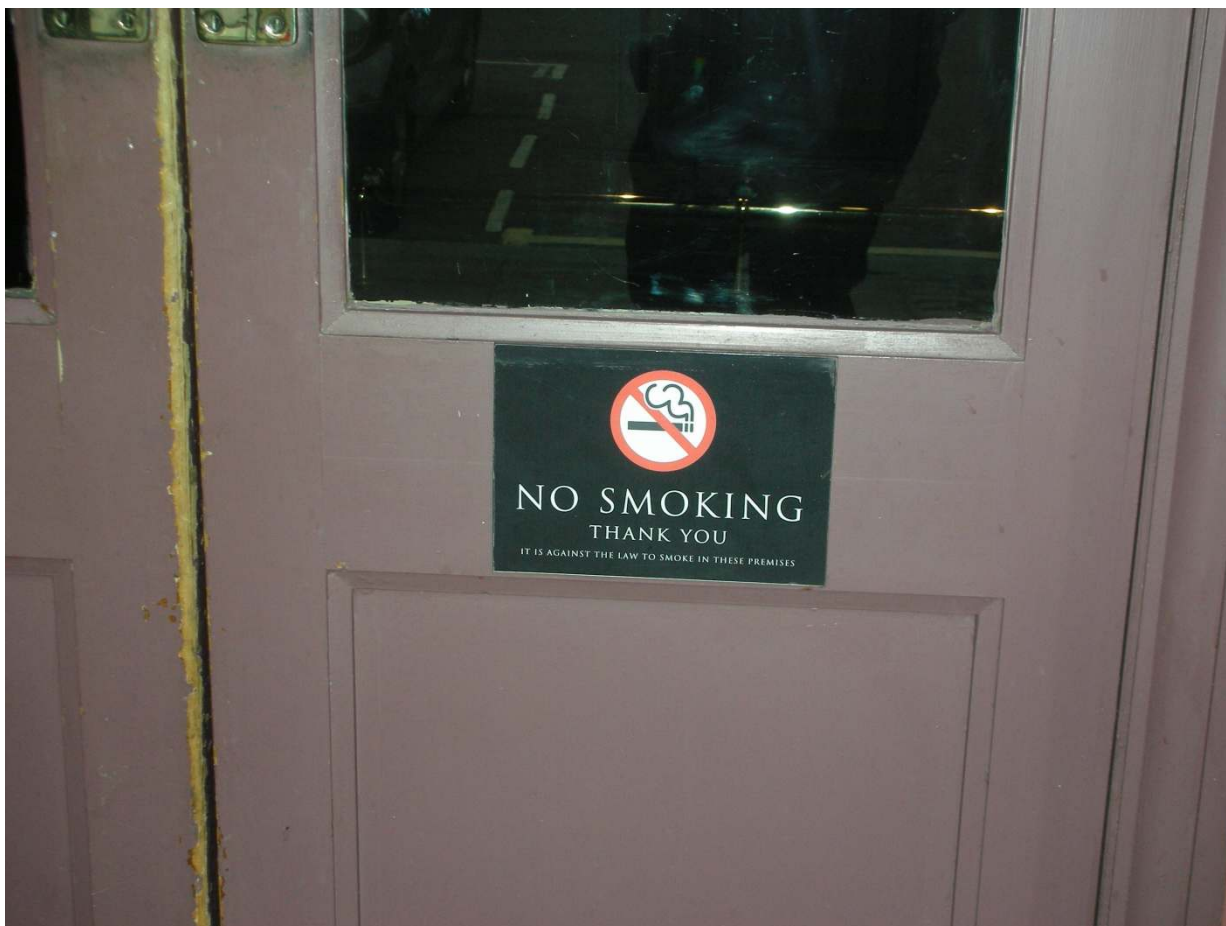
Photo C – Side elevation “NO SMOKING” sign inside lobby door H145, W210mm.