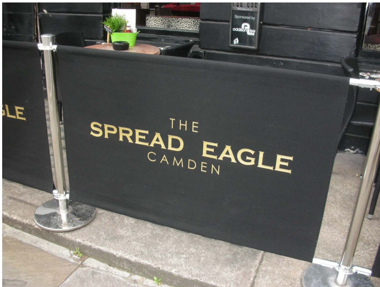
Photo G – Side elevation café barriers material dimensions only H840, W1300mm.