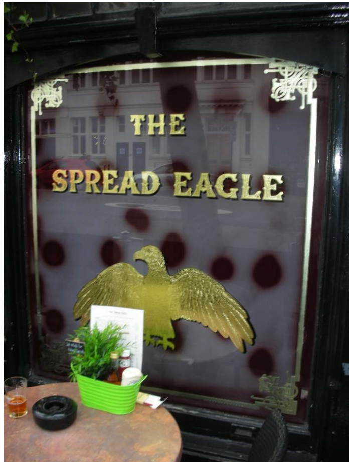
Photo F – Side elevation glazing sign H1300, W1140mm. Tallest font H80mm.