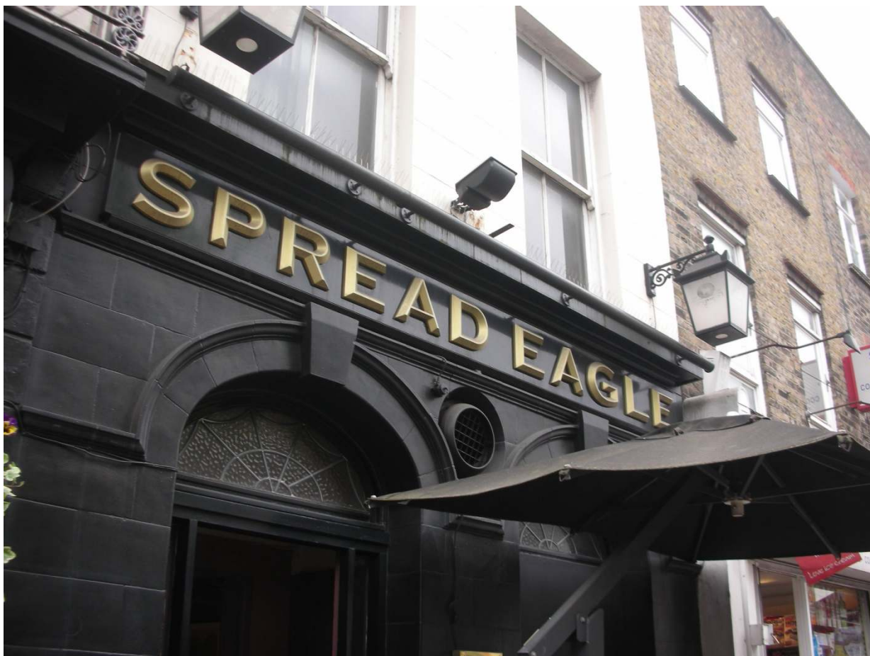
Photo K – Front elevation fascia sign “SPREAD EAGLE” H280, W3900mm, projection 50mm. Trough lighting above.