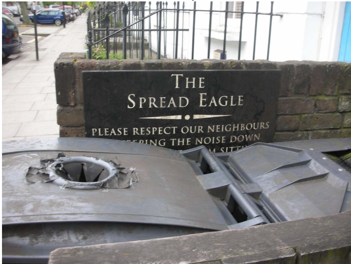
Photo H – Side elevation sign screwed to brick wall (obscured by bottle bins) H500, W750, D10mm.