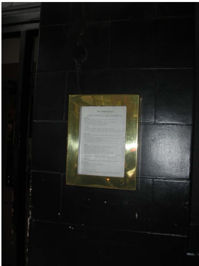
Photo M – Front elevation internally lit menu sign H400, W300, D50mm.