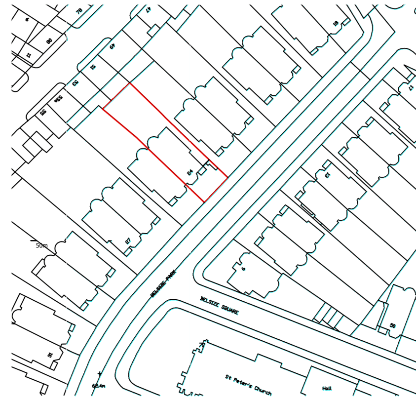
Location plan Scale 1:1250