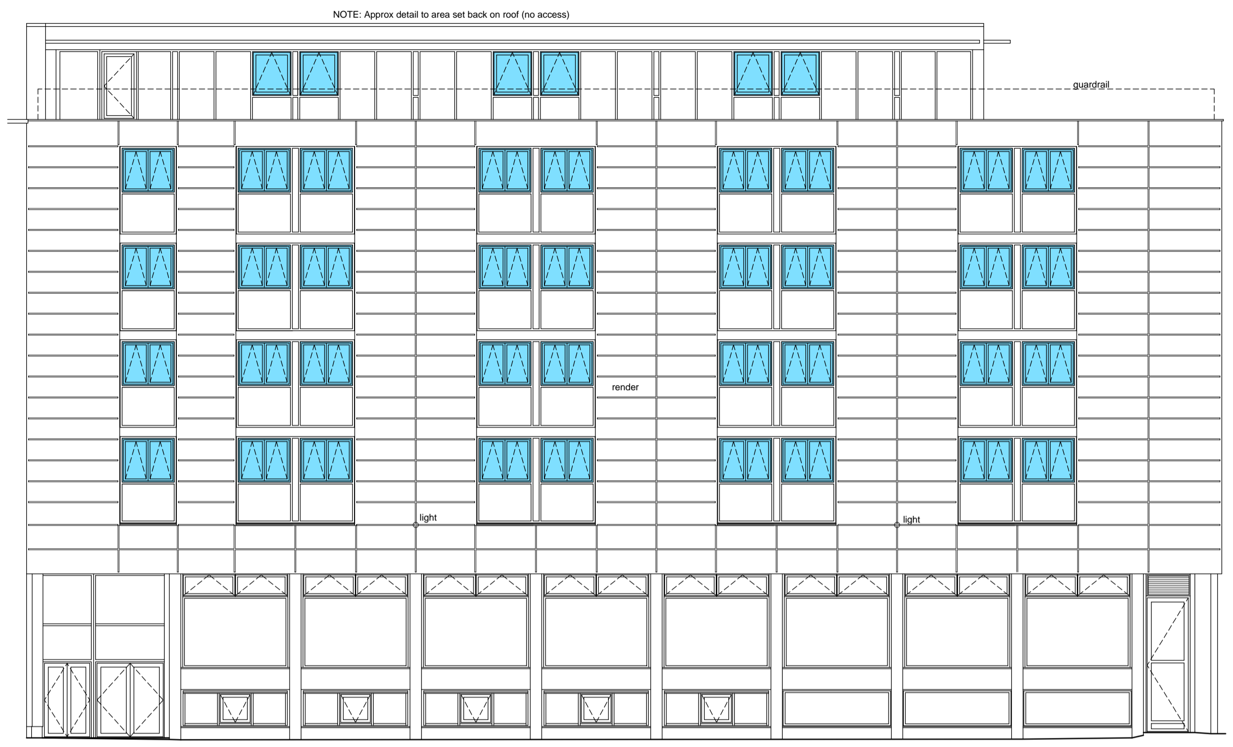
WICKLOW STREET ELEVATION