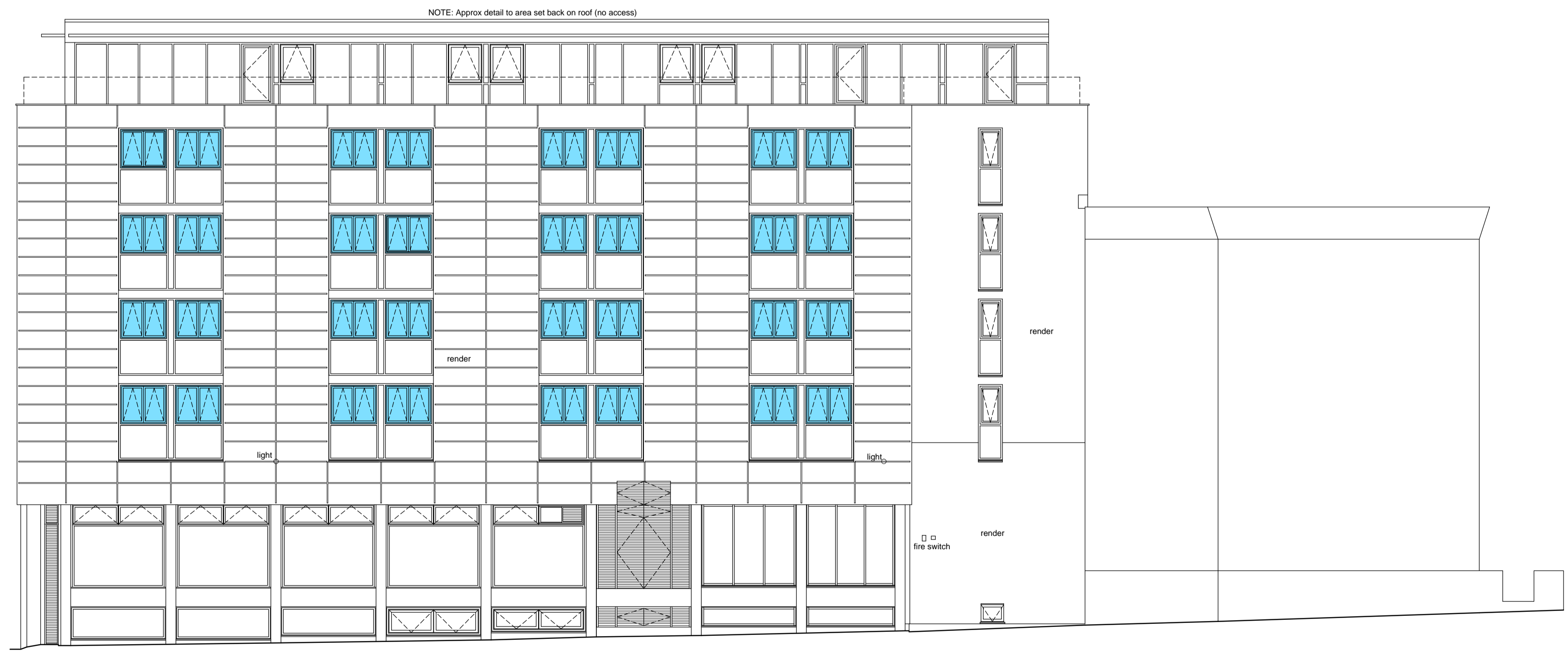
ST.CHADS PLACE ELEVATION