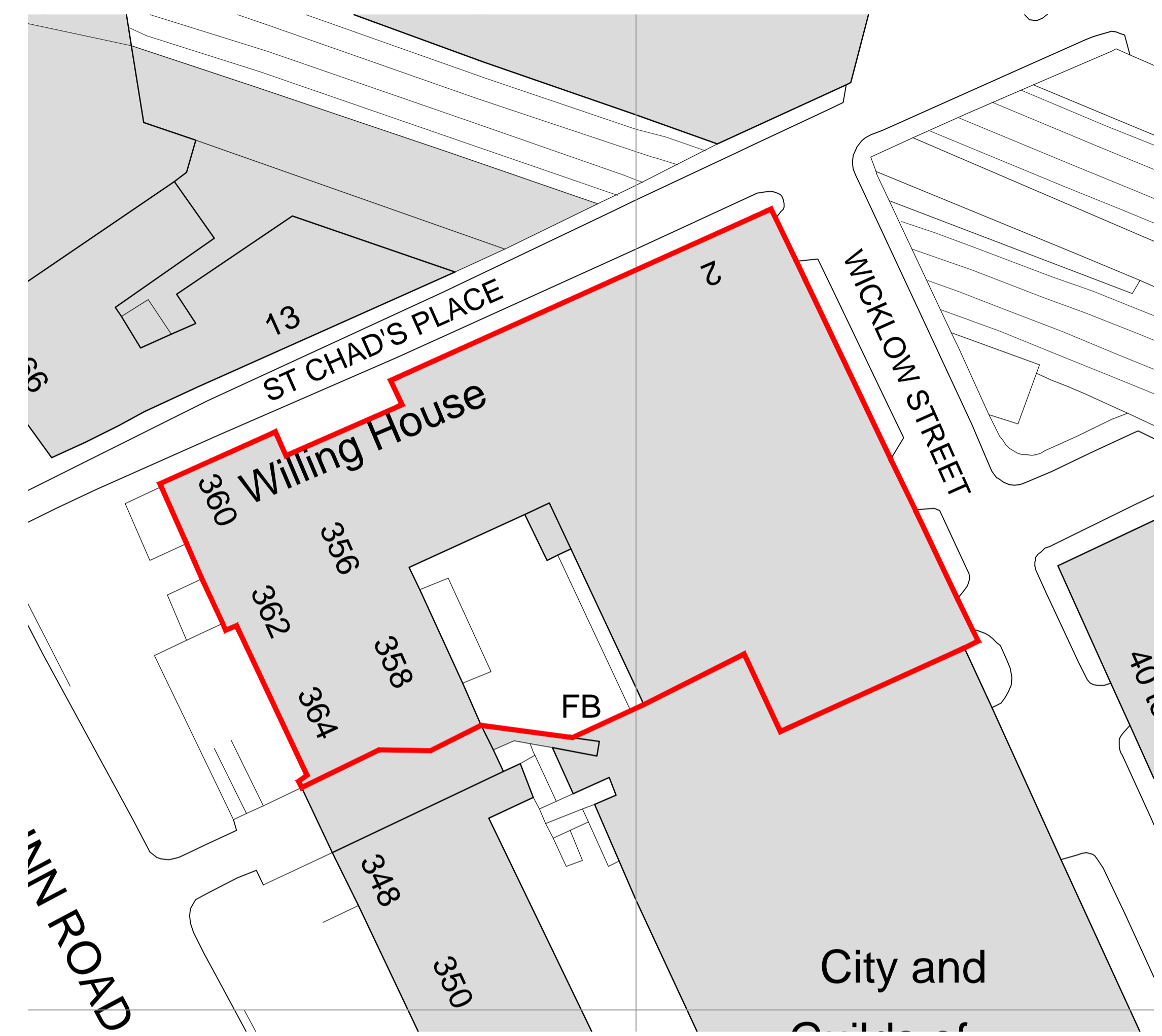
SITE PLAN 1:250