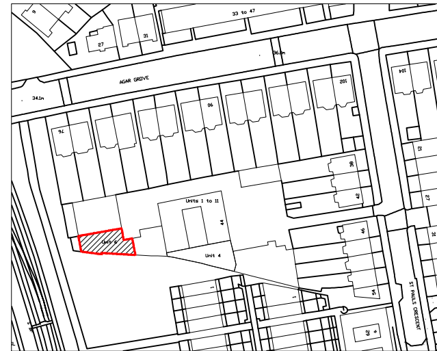
Block plan 1/1250