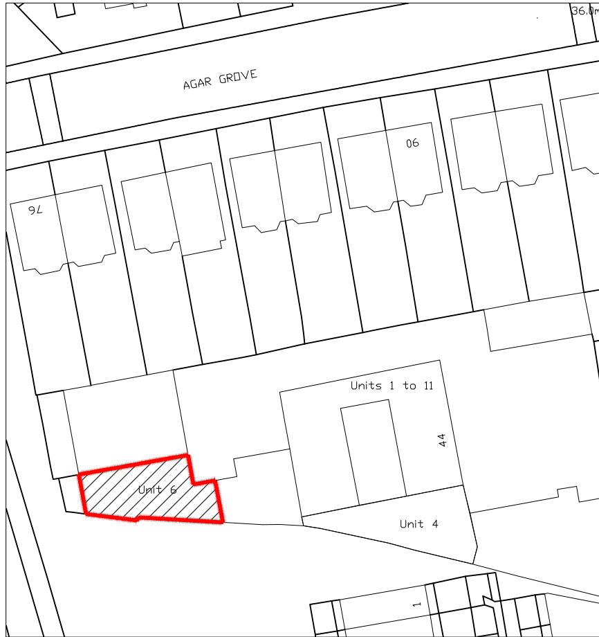
Location plan 1/500